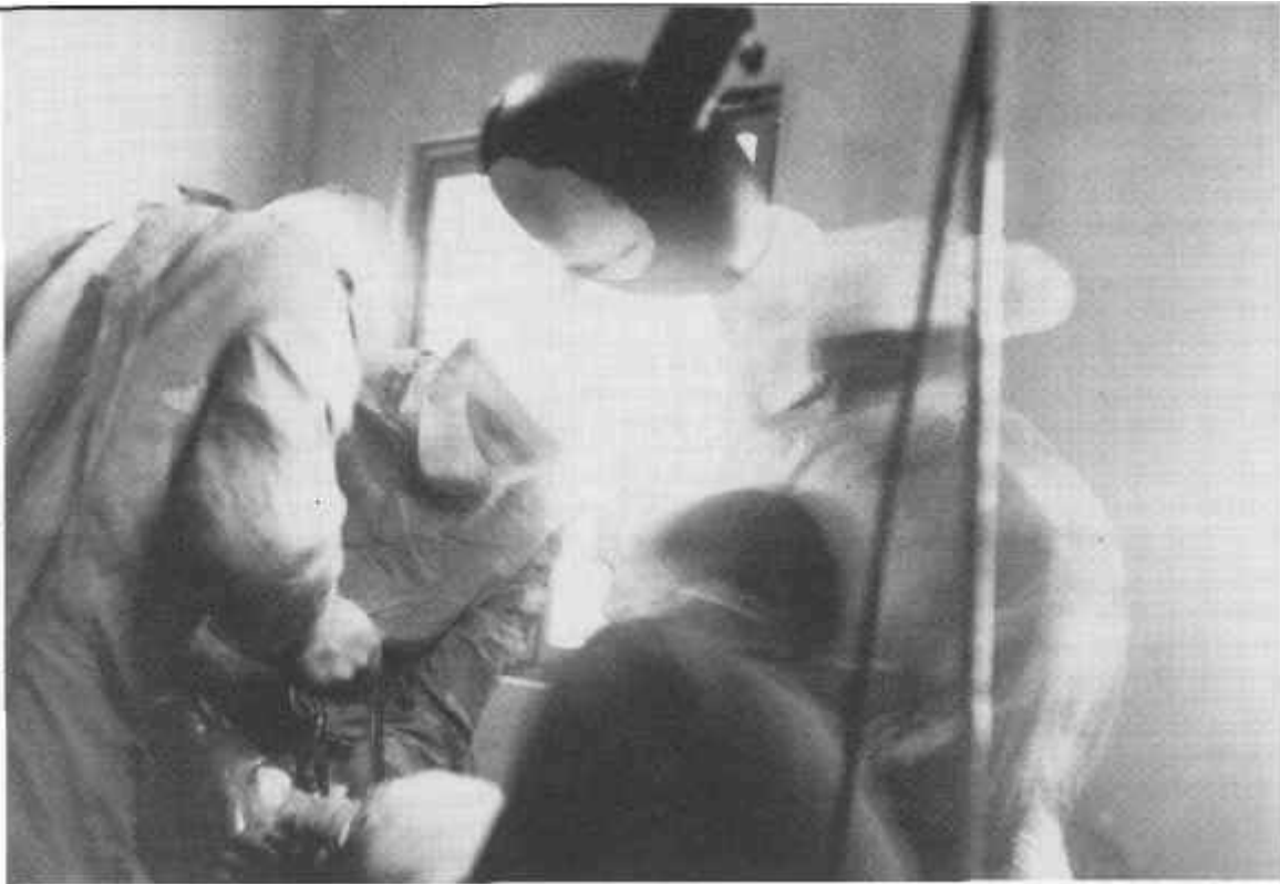
Clandestine photograph of operating room scene in the lazaret of Stalag 8B, Lamsdorf, ca. 1943, showing femur being sawn through in an upper-leg amputation.