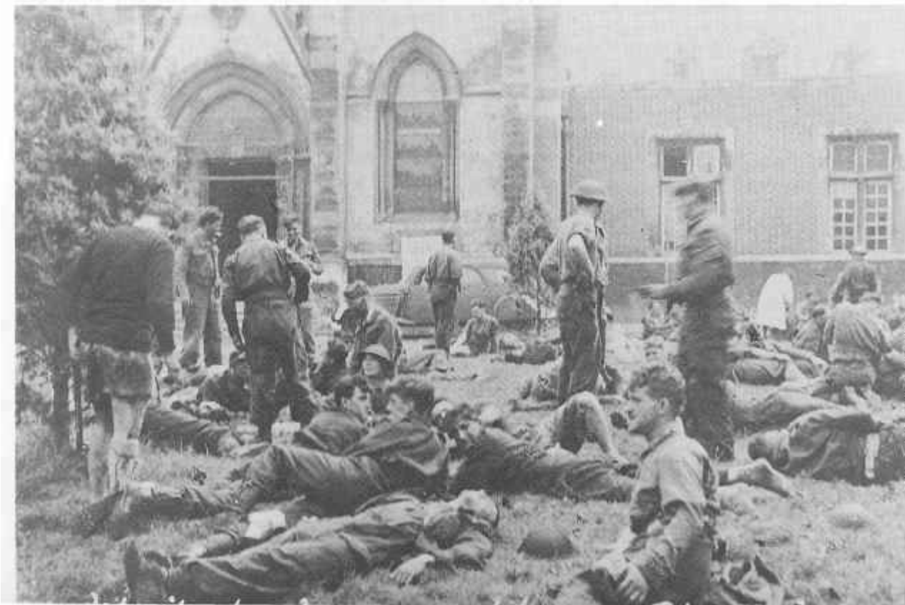
Canadian wounded await treatment following the raid.

In assessing any such claim, it must be kept in mind that much rough and ready treatment is carried out in emergency situations involving large numbers of casualties. The Germans not only had responsibility thrust on them for 600 Allied casualties, but they also had 326 of their own wounded who required care. 24 No local military medical establishment can cope instantaneously and effectively with more than 900 casualties, many very severe, that have been sustained in a few hours' fighting in a small geographical area. In cases where the wounds are (from the comfort of the historian's armchair) "minor" in nature, treatment is usually cursory in the initial stages. This triage occurs in peace as in war, and whether casualties are friend or foe. Moreover, there were apparently cultural differences in the use of anaesthesia. A British surgeon left behind at Dunkirk observed this, noting that a Belgian surgeon was inclined "to do things without or with insufficient anaesthetic. High standard anaesthetics were a British luxury not to be found on the Continent in the years between the wars." 25