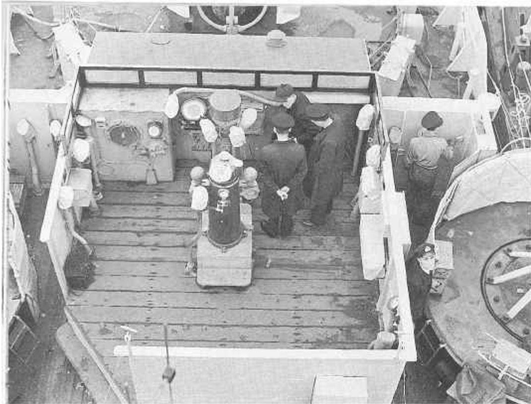
NAC PA 184193

What a modernize corvette bridge looked like by mid-war: HMCS Brandon in November 1943. The square box on the front of the bridge housed the asdic equipment, a gyro compass repeater is mounted just ahead of the magnetic compass binnacle and mounting for 20 mm Oerlikon guns can be seen on either side.