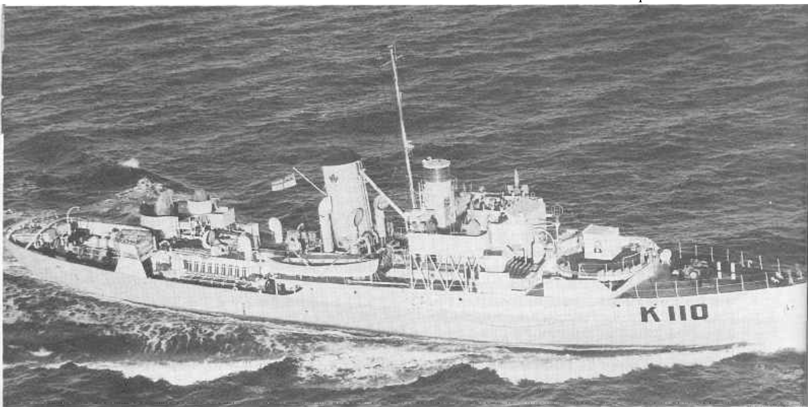
The object of the RCN's desire in 1943: the fully modernized corvette, HMCS Shediac in 1944. Note the hedgehog just forward of the bridge.