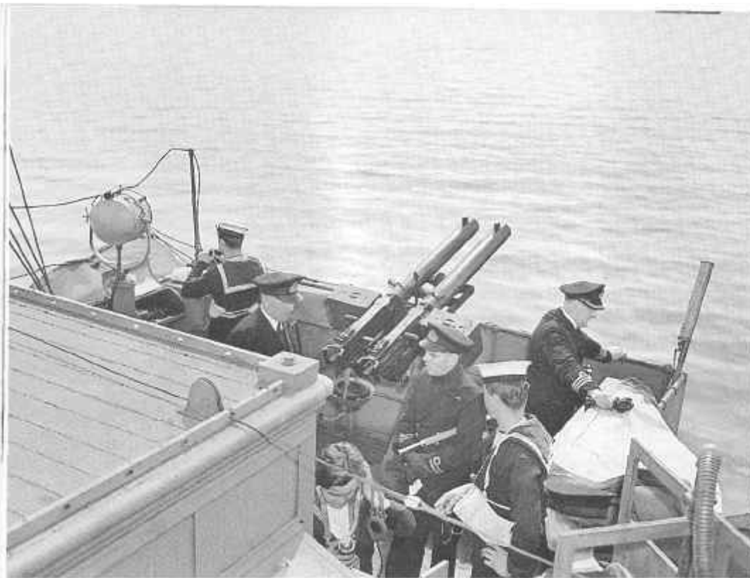
The original corvette bridge, like HMCS Moncton's seen here, during work-ups in May 1942, was ill-suited to the demands of war. The charthouse, in the left foreground, housed the ship's only compass—a magnetic one—and the trace recorder/or the primitive type 123A asdic set, but the captain had to fight his ship from outside and the charthouse itself prevented a full 360 degree view of events. The cramped bridge wings did well to accommodate the twin .50 calibre machine guns seen here.