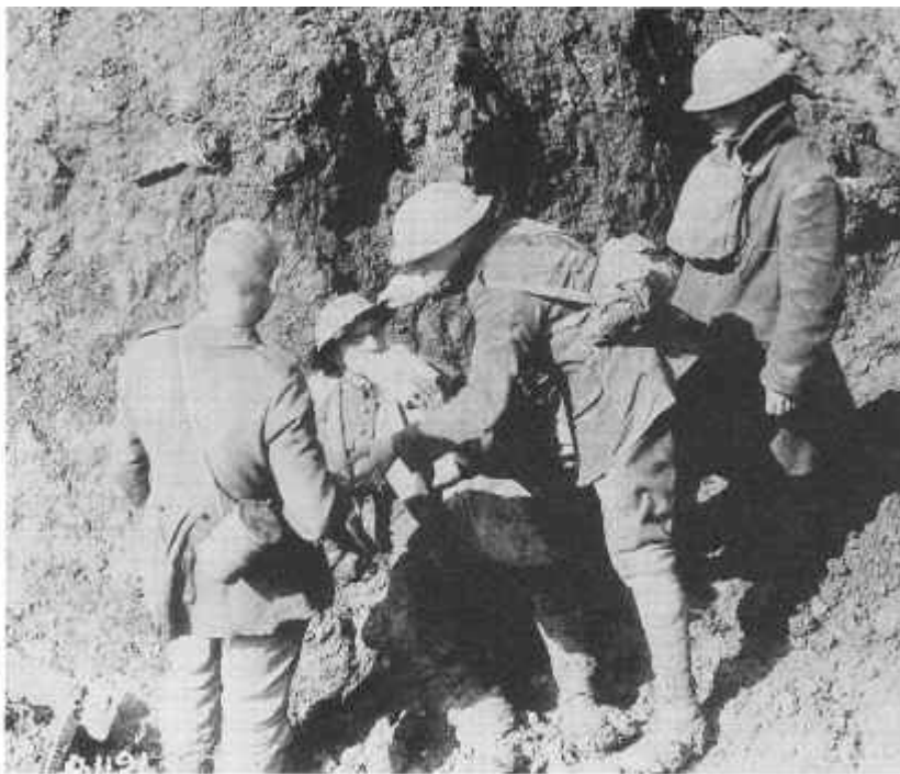
▲ NAC PA 1064