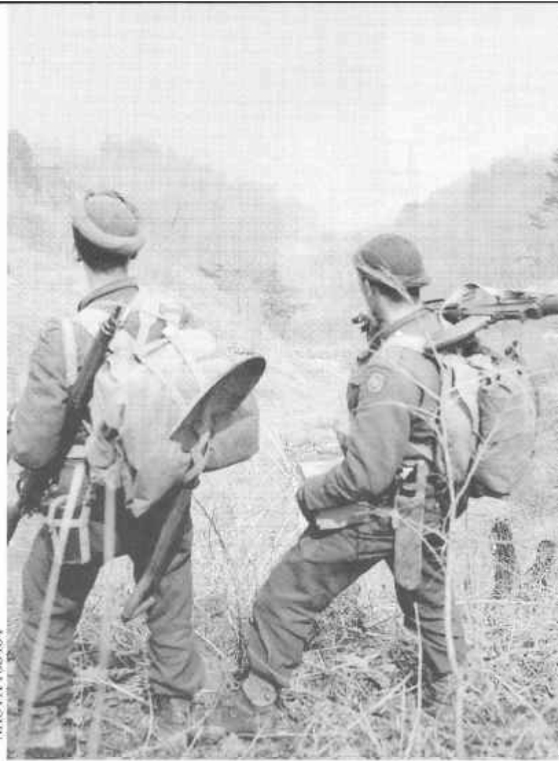
NAC PA 163404

When not dodging Chinese bullets, or, in one instance, a misdirected napalm strike, 35 the men of 2 PPCLI had to contend with blizzards, ice-covered hillsides, perpetually wet clothing, monotonous food, unpotable water (and the diarrhea that often accompanies it), blisters, biting pack straps, and the innumerable other discomforts that comprise the infantryman's lot. But no matter how arduous their stint at the front became, they could take solace in knowing that their regular rotation out of the line would be punctuated by hot meals, warm baths, and cold beer. It was during one of these respites from the fighting that 2 PPCLI received orders to establish defensive positions astride the Kap'yong River.