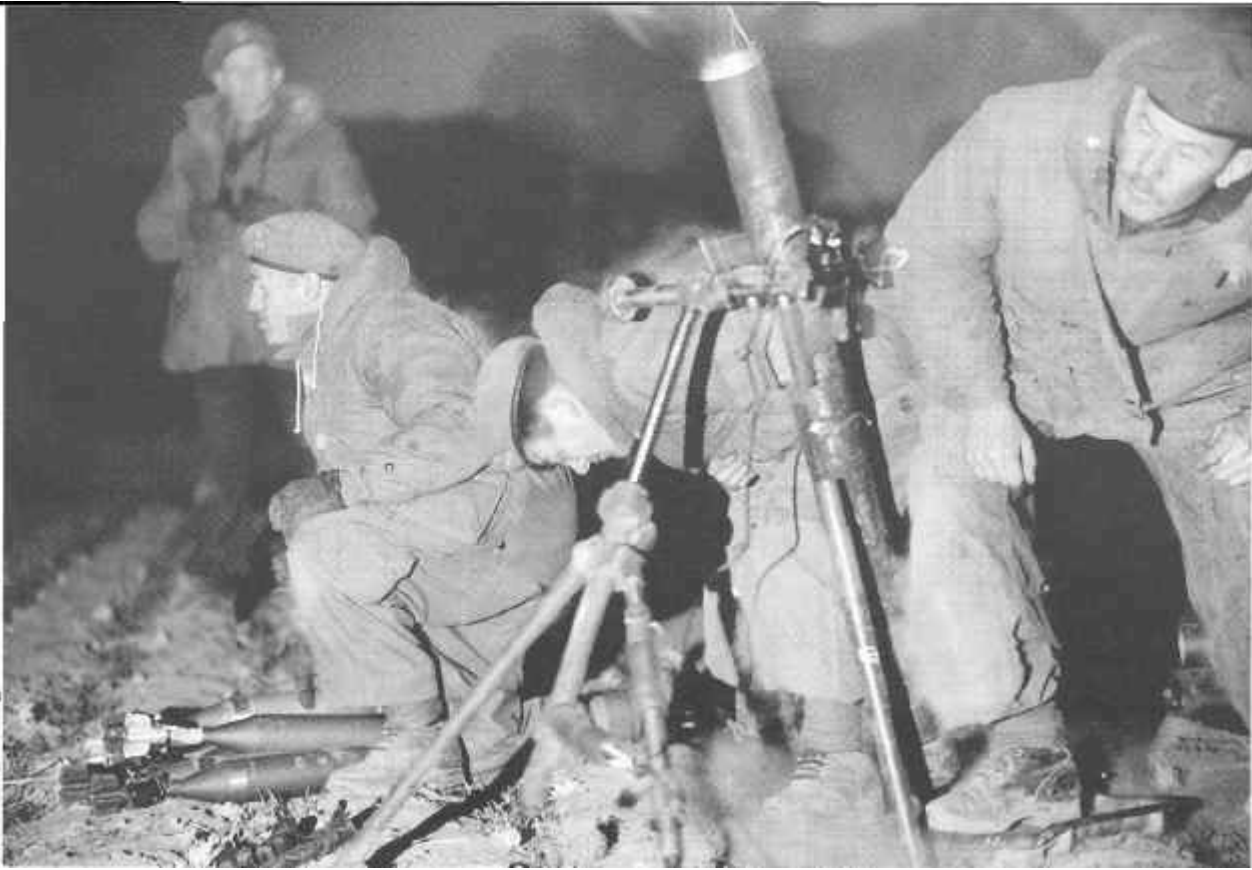
Soldiers from 2 PPCLI fire their mortar during training at Miryang, Korea, February 1951.