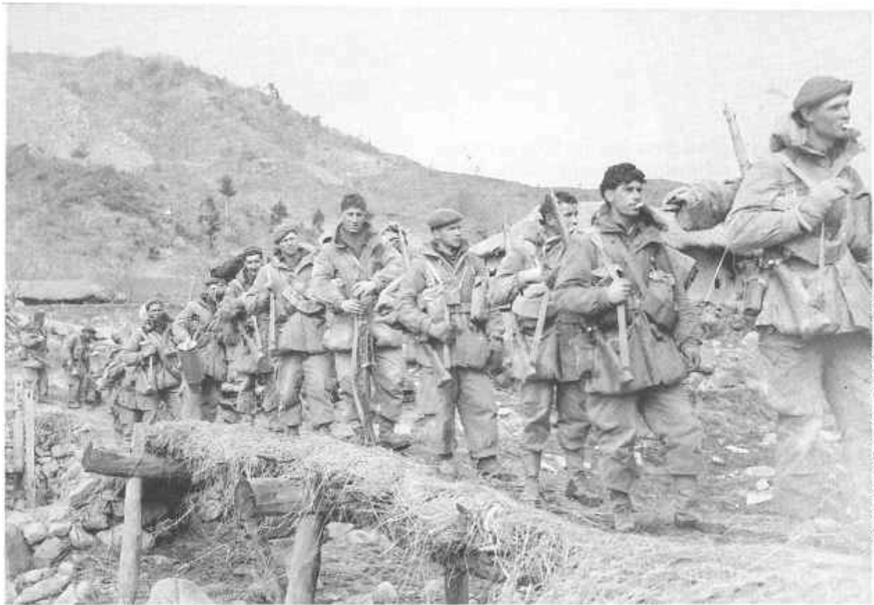
Troops of "B" Company, 2 PPCLI crossing a log bridge, February 1951.

advancing CCF juggernaut. Suddenly, the occupation duties assigned to the half-trained Patricias ceased to exist. The battalion would see combat, after all.