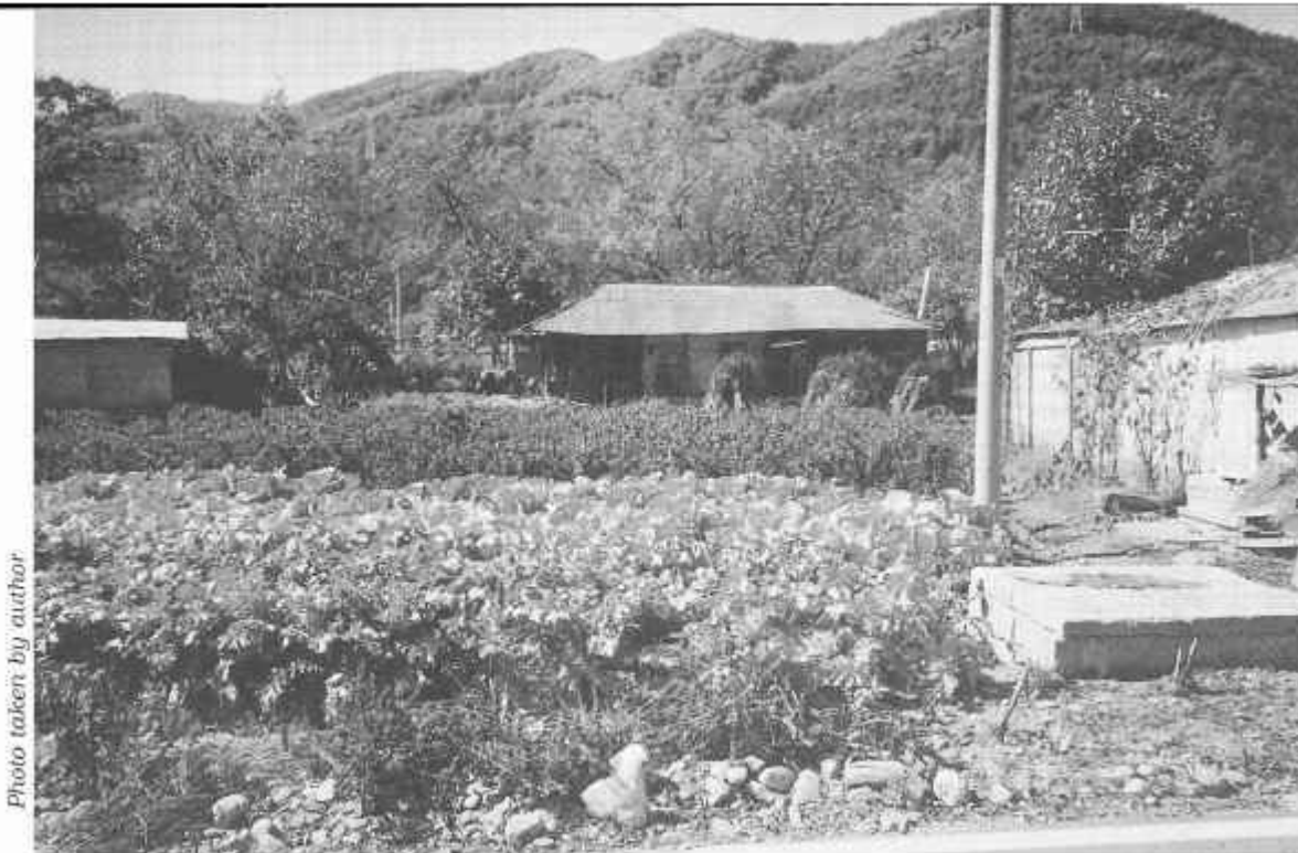
Small Korean village at the eastern base of Hill 677.

Consequently, each rifle company was responsible for its own defended locality, with platoons deployed to be mutually supporting. Gaps between the "company islands" were covered by defensive fire (DF) tasks of the MMG sections, the battalion mortars, and the field guns of supporting artillery units which included not only the 16 NZFR, but also several American 9th Corps artillery formations. 45 Owing to the steepness of the terrain, it was extremely difficult to co-ordinate all of the Patricias' supporting weapons into a coherent battalion fire plan. 46 The gradient of Hill 677 is so steep in some places that one must crawl on hands and knees, as this author discovered firsthand during a recent research sojourn to the battle site. This steepness restricted MMG, mortar and artillery DF tasks to the main ridge line approaches to the Canadians' positions. Approaches leading to the company and platoon positions between the main ridge lines had to be covered by small arms fire and hand grenades.