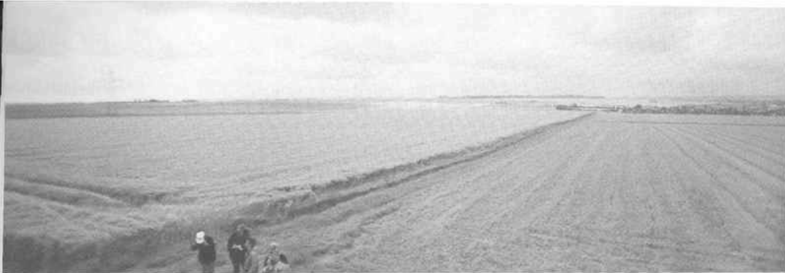
A panoramic shot looking south from the location on Point 67 where the Toronto Scottish is placing their memorial.

were the citizen soldiers who would form the core of Canada's army.