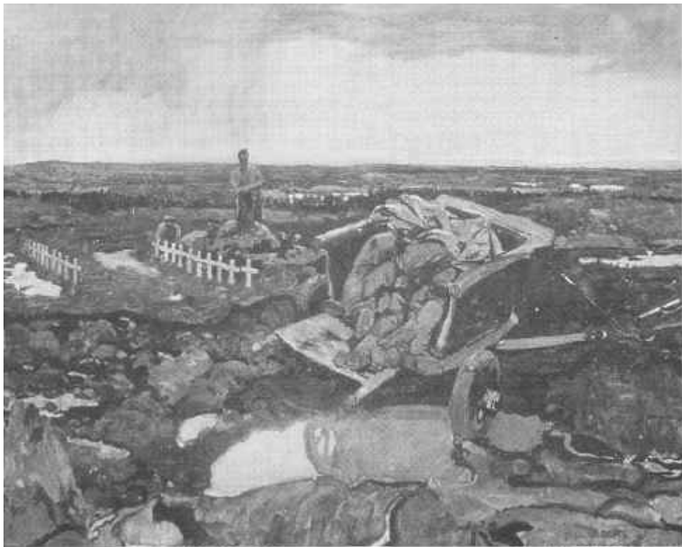
For What? Painted in 1918 by Fred Varley (1881-1969)