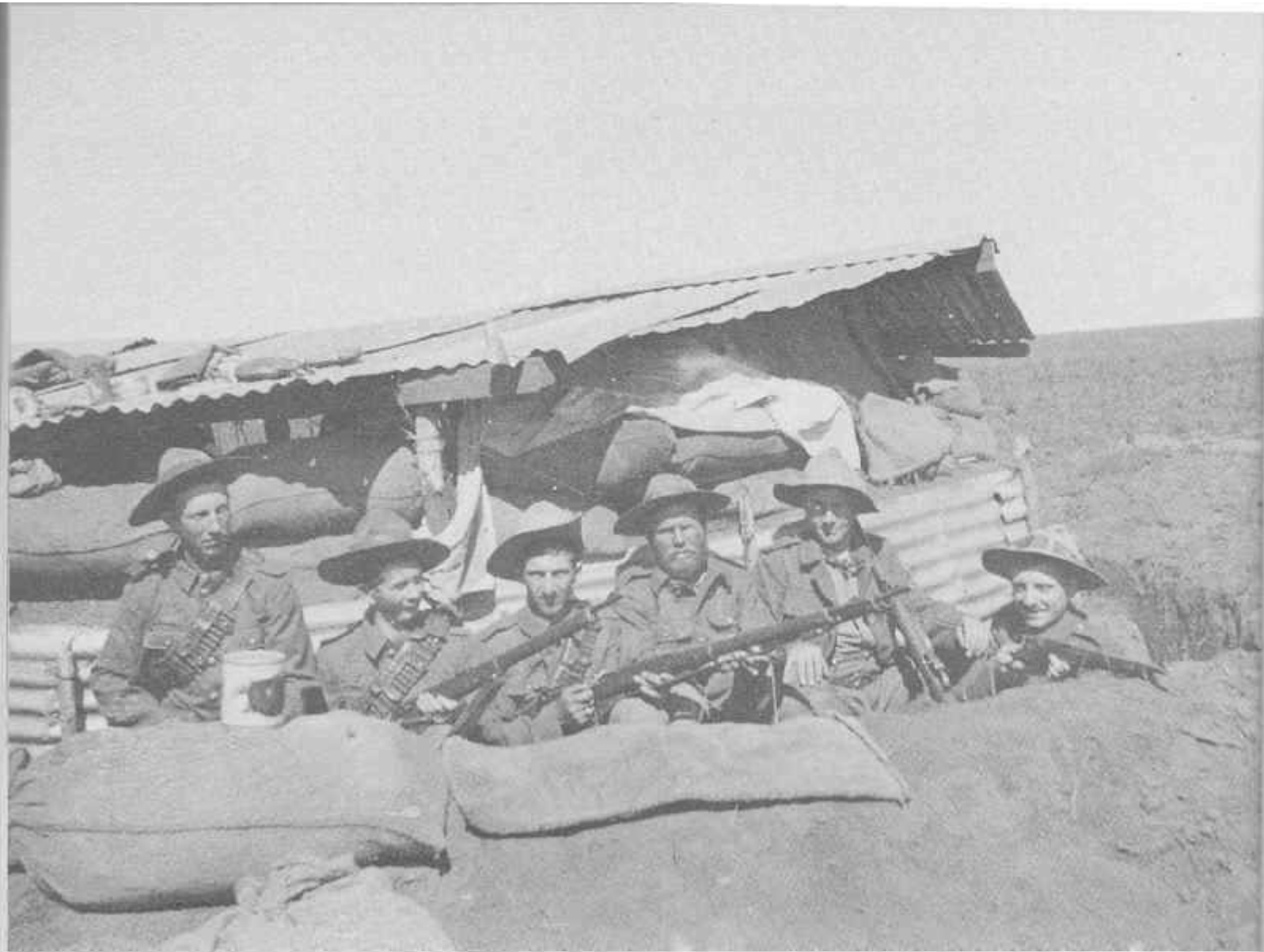
No inscription. An obviously staged photo providing a good view of a blockhouse and its defenders. Corrugated iron was common as a building material in South Africa, as it was to be later in the First World War.