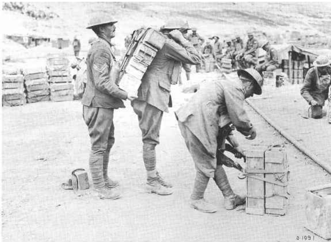
A corporal helps one of his soldiers to hoist his load while others adjust their tumplines. Leaving aside the question of weight, this photo clearly illustrates that the sheer bulk of the boxes being carried would preclude their easy conveyance without aid of the tumpline.

on many occasions) but the work had then to be necessarily rather slow and tedious at night.