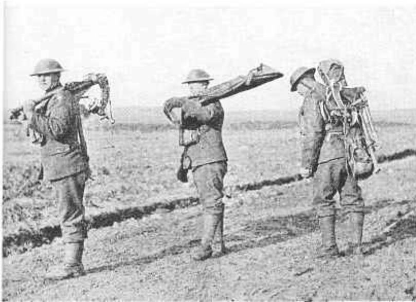
Nature of Load: Vickers Gun Weight of Load: 93 lbs. Usual Carrying Party: 2 men

I figured out at one time, from the reports that I had received from the various formations using the tumpline,