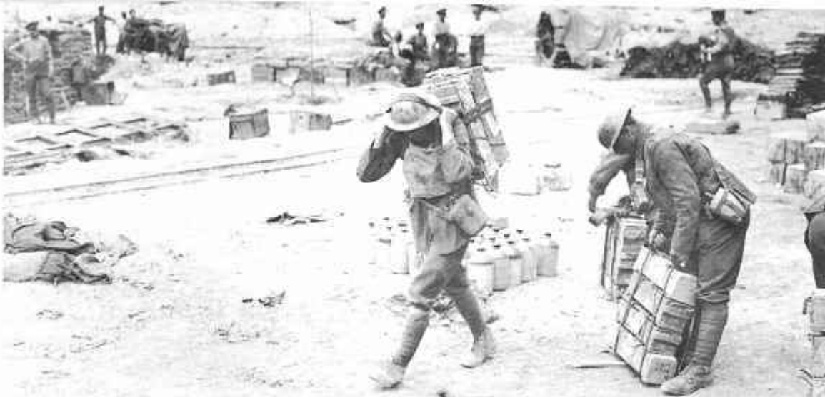
A Canadian soldier makes his way out of the supply depot carrying his load using the tumpline while his companions prepare to get under way. Note the collection of rumjugs in the centre of the photo.

carry the load with and without the tumpline, the percentage of manpower saved by using the tumpline, together with remarks on each class of load.