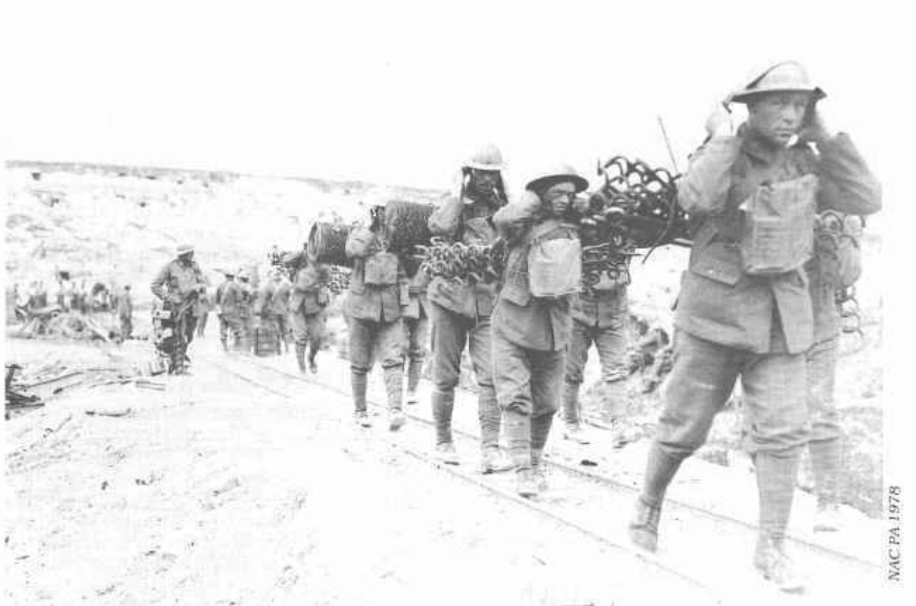
A carrying party from the 11th Canadian Brigade Tumpline Company making their way towards the frontline, September 1917.

obtain straps seven feet long, two pieces can be joined together, although this joint sometimes interferes with the quick tying or untying of the knot. Tumplines made of canvas or web are absolutely useless, as they become soggy, stringy, and wrinkled when they get wet, and difficult to untie under these conditions, and also chafe the head. Good tumplines can be manufactured by any regimental saddler or shoemaker from salvaged surcingles and reins.