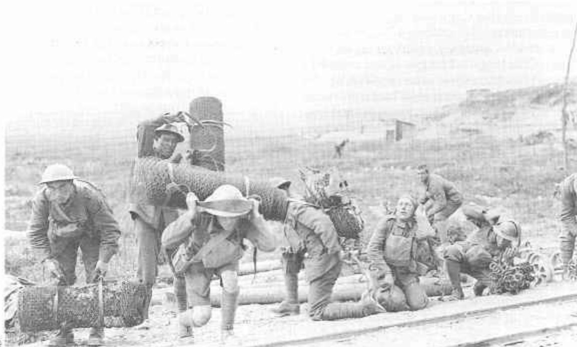
A variety of items are being carried using the tumpline: rolls of wire mesh, rolls of barbed wire and spiral pickets on which to string the barbed wire.

A more detailed list will be found at the end of these notes giving practically all the various articles that are required to be moved in the forward area, showing the size or nature of the load, the weight, the number of men required to