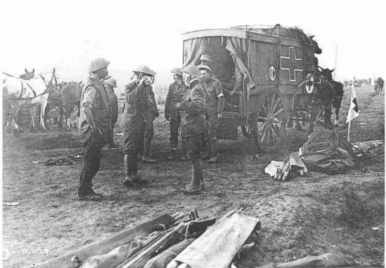
Rum was used to dull the pain of the wounded. Canadian soldiers receive a welcome drink at an advanced Dressing Station in France. September 1916.