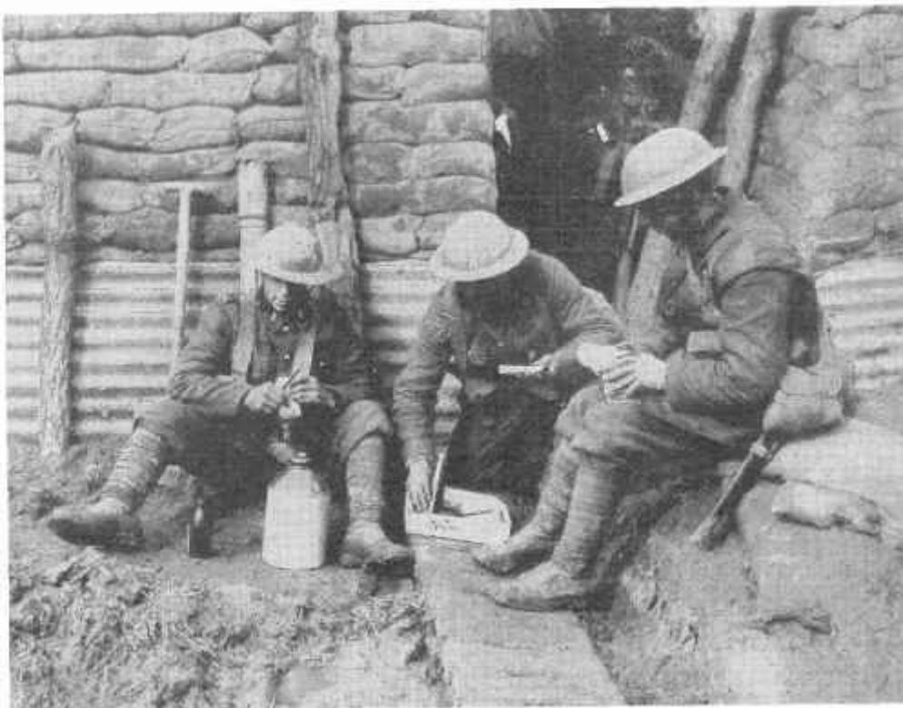
Canadian soldiers enjoy a quiet moment in the trenches, with a rum jug and beer bottles evident.