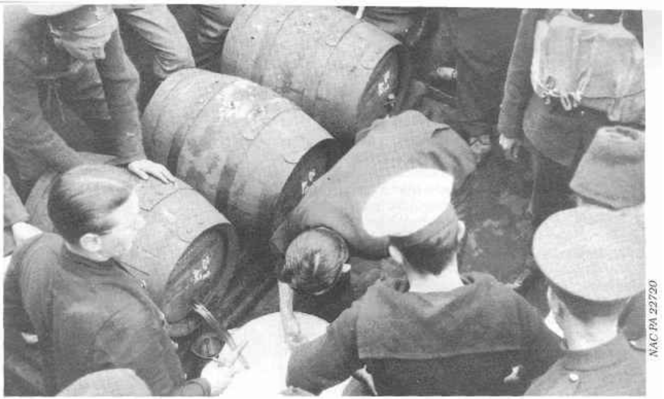
The WCTU and other temperance groups sought also to deny Canadian soldiers beer, without success. Here, soldiers from the 92nd Highlanders receive their Beer issue on board Empress of Britain, 24 May 1916.

drunkenness and depravity," he wrote to Prime Minister Borden in January 1917. 23 Temperance texts like Vance Thompson's Drink and Be Sober (1917) went so far as to exclaim: "Men with drink...cannot even fight...Drink does not give courage...all it does is to destroy the moral nature in the man." 24