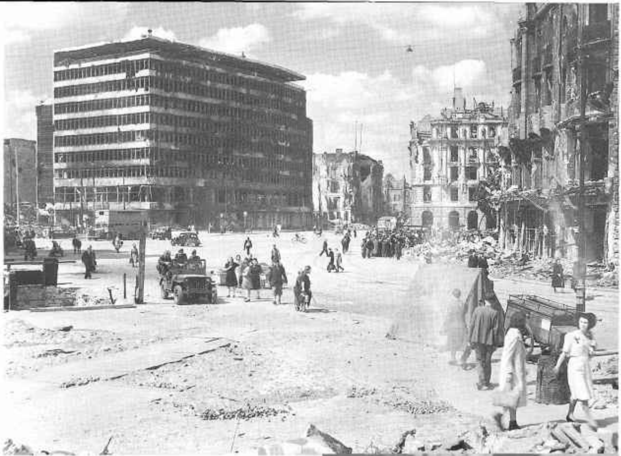
Above: The destruction in the centre of Berlin is readily apparent in this photo taken at Potsdam Palace, 9 July 1945. The rubble in the streets has been cleaned up, but only the gutted shells of buildings remain.