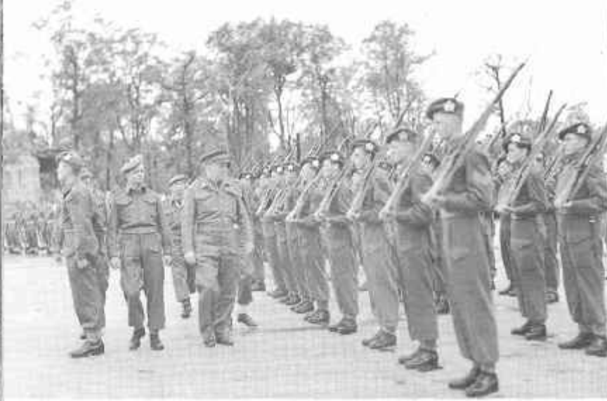
Above left: The Pipes & Drums of the the Argyll and Sutherland Highlanders on parade in Berlin, 20 July 1945.