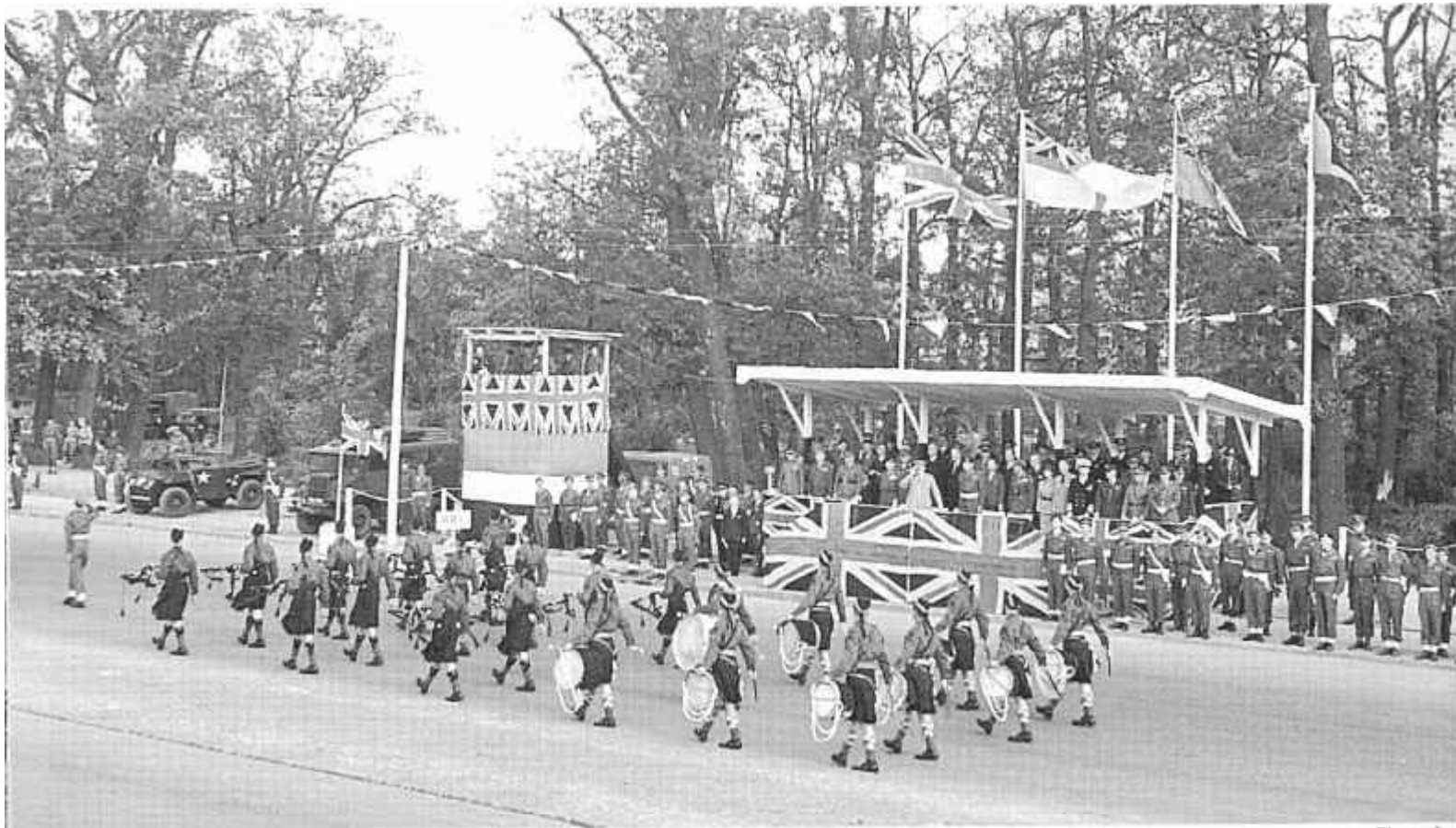
The Pipe Band of the Argyll & Sutherland Highlanders of Canada marching past the reviewing stand during the Victory Parade, 21 July 1945. Visible on the stand are, among others, Winston Churchill (taking salute) and B.L. Montgomery (with white belt).