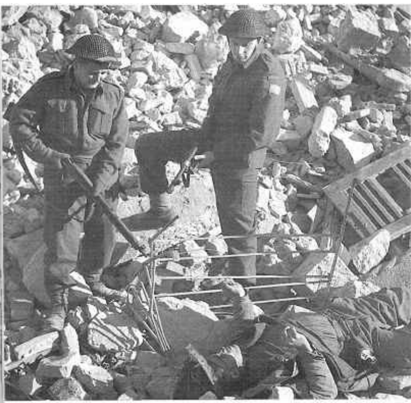
Left: Canadian soldiers look at the body of a dead German in Ortona, 30 December 1943.