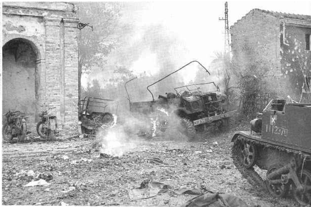
A Canadian truck and jeep burning after being hit by German mortar shells, Ortona, Italy, 23 December 1943