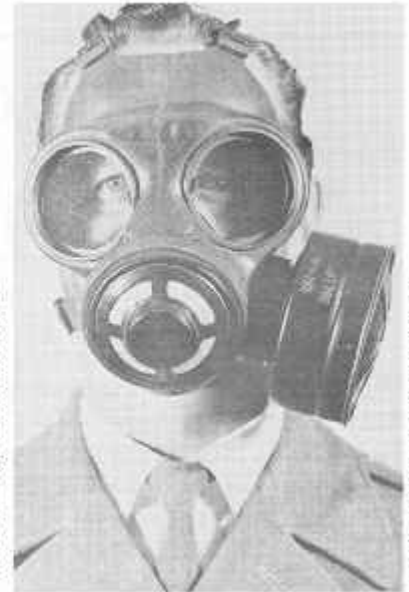
These two photographs shows a German Gas Mask that was captured in mid-1915 by the Canadians. The photograph on the left show it worn with the face mask while the photo in the centre show it with the face mask removed. Note that the wearer had to breath through his mouth and there were clips to close the nose. This German mask was much more practical than the British version, yet it still would have been uncomfortable to wear for long periods of time.