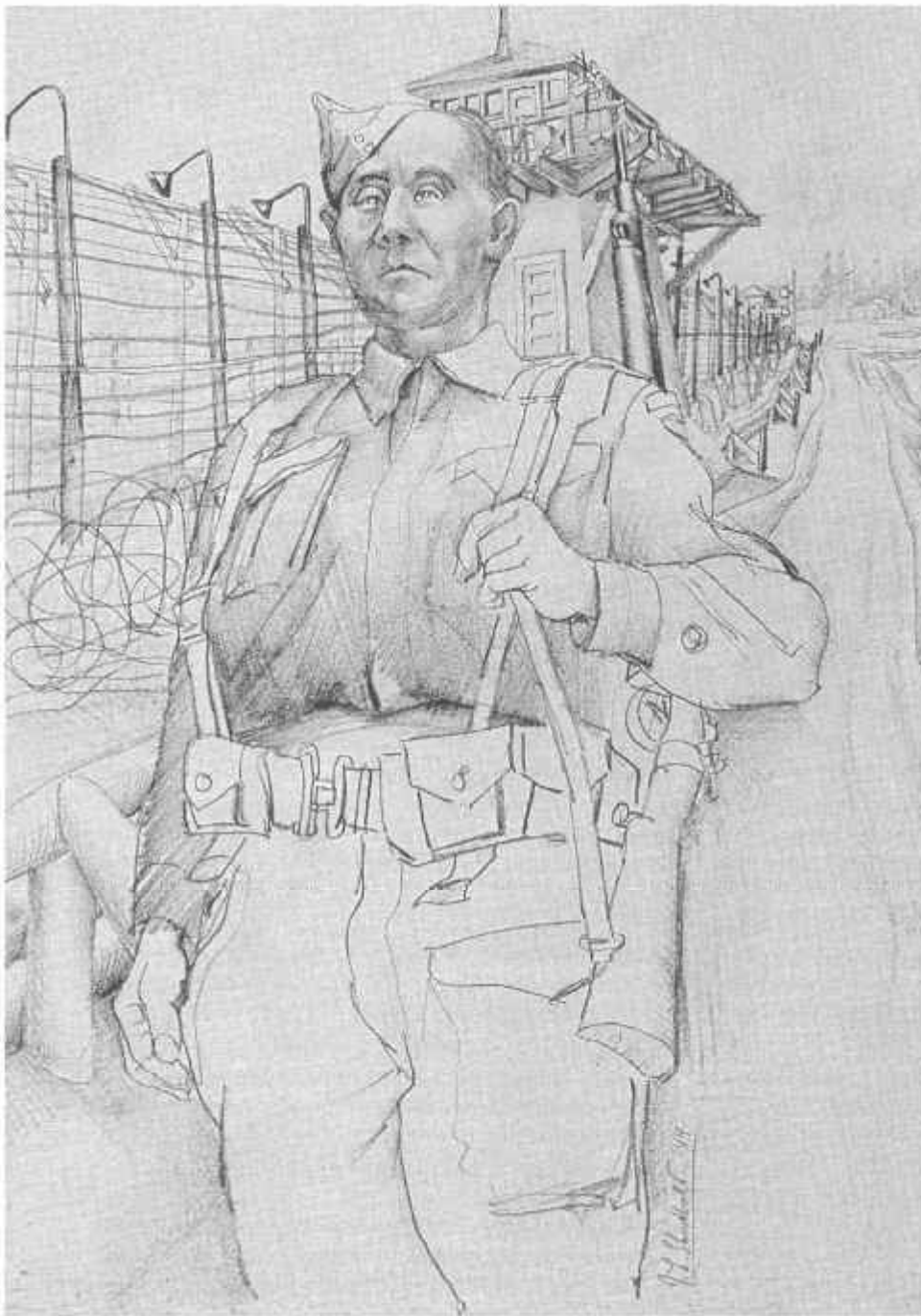
Left: A Veterans Guard on Tour of Inspection.