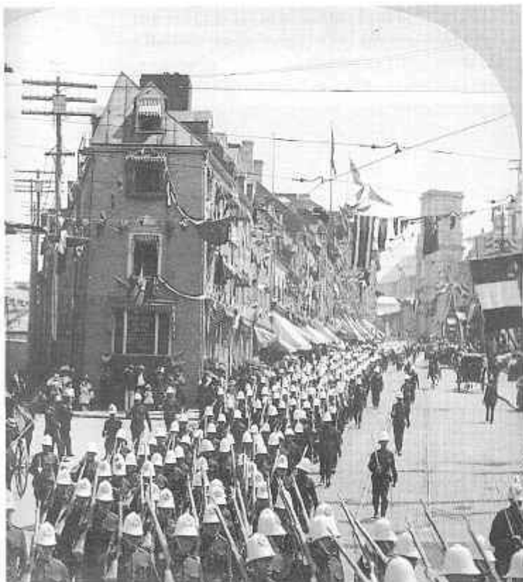
Two views of Canadian Militia marching through the decorated streets of Quebec on their return from a rehearsal.

Wednesday, 22 July witnessed the arrival of His Royal Highness The Prince of Wales aboard HMS Indomitable , and amidst a flurry of artillery