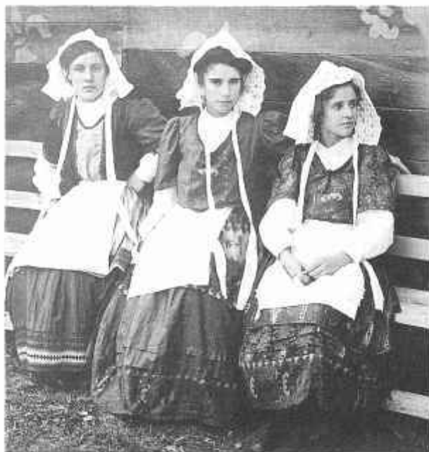
Maidens of New France rest before an Historical Pageant.

represent the views of the Montreal garrison, met with the Minister of Militia, Sir Frederick Borden, on 11 May, while the London Advertiser reported that plans were now being "subjected to extensive alterations in the direction of reduction." Two days later it was announced that militia summer training would proceed as usual, but that a mere 5,000 troops would be financed by the Department to participate in the Tercentenary. Borden cited the Battlefields Commission as being responsible for making arrangements for the troops at Quebec and further clouded the issue with reference to the difficulty in obtaining special trains during the peak immigration season. As a compromise solution it was a failure, and Colonel Sam Hughes berated the Minister with inflammatory questions in the House. Toronto's Mail and Empire trumpeted "NO MUSTER OF CANADA'S ARMY ON QUEBEC BATTLEFIELDS," while the Halifax Herald's headline of 19 May was "Extravagant As To Grafters But Parsimonious As To A Great National Demonstration." Readers of the latter were reminded that "Now, everybody must recognize, in the light of custom and existing fashions, that the military display must be looked to as the prime feature of all such celebrations."