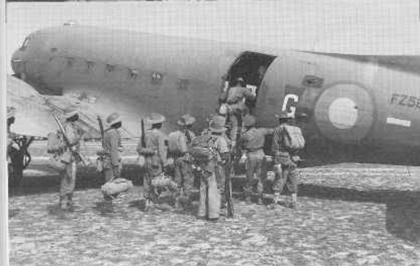
Dakotas at war (clockwise from top left): Ground crew pose in front of a 435 Squadron Dak and fuel truck (CFPU 60548); Paratroopers prepare for a jump on board a 436 Squadron Dakota (CFPU PL60632); Troops board a 435 Squadron Dakota in Burma, December 1944 (CFPU PL 60111).

returned to 177 Beaufighter Squadron and flew 20 trips to finish his tour. 30