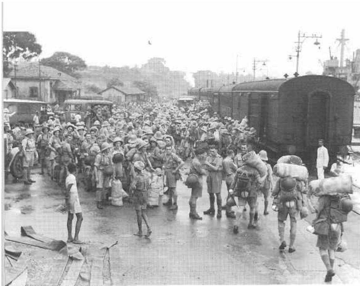
Personnel of 413 Squadron RCAF arrive in Colombo, Ceylon.