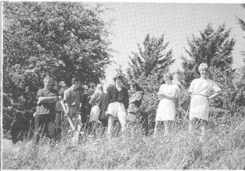
Students examine the site for the Caen Memorial Garden project, August 1993.

experiences and discussions. The project would grow out of those, their own graphic interpretations of the power of silence and the psychology of the unknown, the battle landscape, images from the Museum's display, (the young girl hanged at Auschwitz, the silhouetted German soldier waiting at the cliff edge), the ghostly flatness of the beaches and the waving wheatfields.