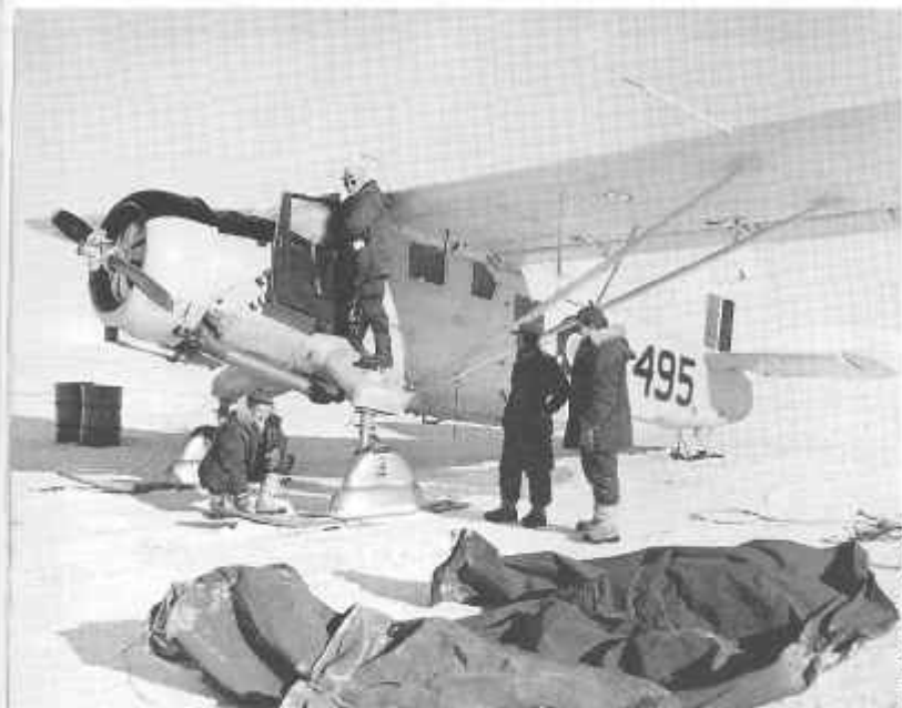
NAC PA 196939