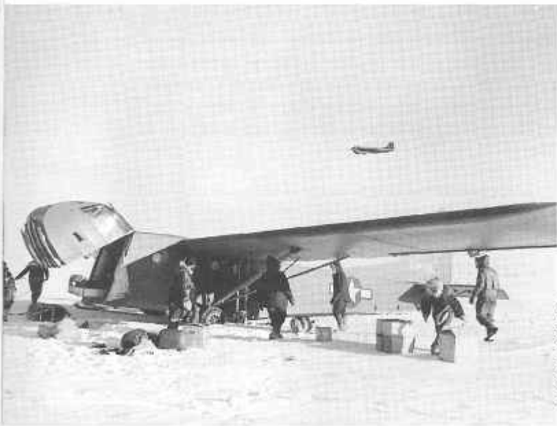
NAC PA 196940

Though primarily an army exercise, the Air Force was crucial to the success of Musk Ox. A variety of aircraft were used to keep the expedition supplied including the Noordyn Norseman (above left), the Waco CG-4 Glider (below left) and the C-47 Dakota (below left, in background).