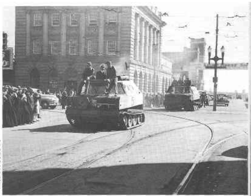
Right: The end of the journey - the arrival and parade through Edmonton.