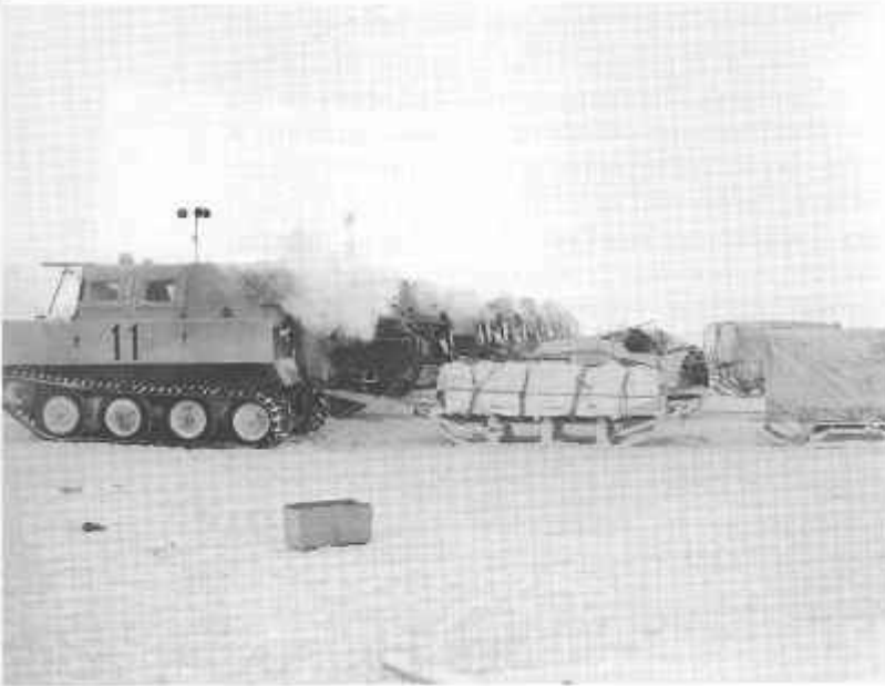
Left: A line of Penguins pulling sleds awaits the word to depart Churchill.

(Lieutenant-Colonel Graham Rowley commanding) proceeded from Churchill to Baker Lake to prepare an airstrip and establish a station recording weather and magnetic compass information. Keeping this party supplied was the first major test of army/air co-operation this far north. It was quickly realized that air drops directly over vehicles or encampments might not be possible at the desired times, and the recovery of scattered cargoes slowed the tractors. A more efficient method was to paradrop supplies several miles ahead of the troops, preferably at a possible bivouac location. A small team landed by ski-equipped Norseman might then recover the parachutes and organize the cache into a compact site.