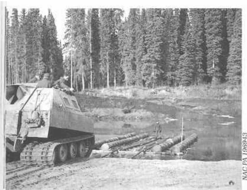
Left: Fording a river on a makeshift raft made from locally cut logs and air-dropped barrels.