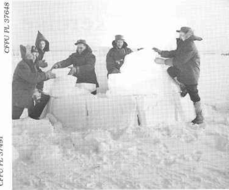
Top left: The buildings at Churchill were very flammable. In one case two servicemen were killed when caught in a burning building.