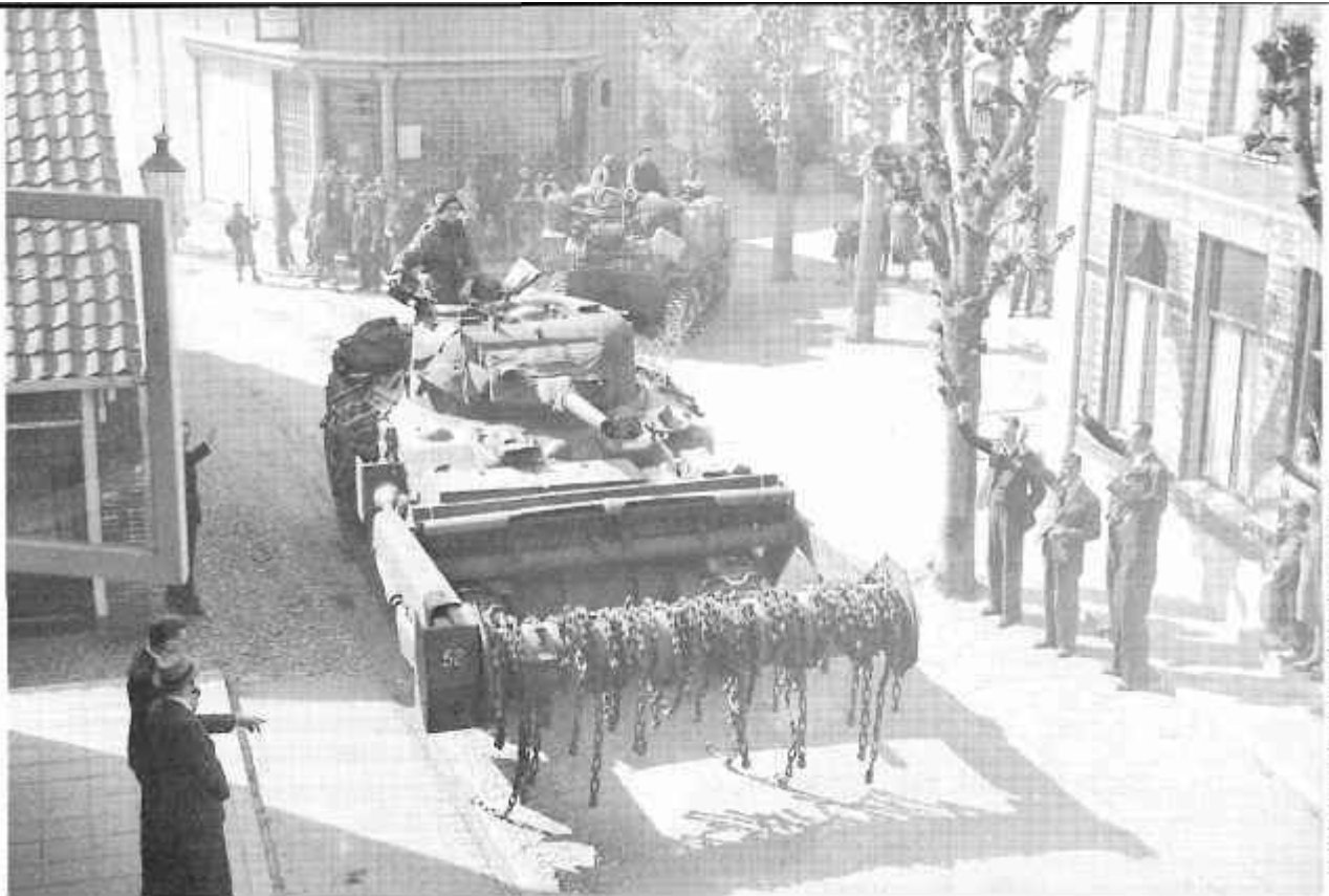
Canadian armour, including a Sherman "Flail" tank, receives a warm welcome as it passes through the streets of Putten, Holland, 18 April 1945.

another advance. "C" Company forced its way through wire and considerable opposition throughout the night, first light finding them 500 yards short of Heveskes. Meanwhile, "A" Company moved off to the north-east, following a canal that ended at Termunterzijl on the coast. As they approached their objectives, small arms fire increased, and the company was suddenly surrounded. Only one platoon escaped the trap that had been laid, and the rest of the company found itself in the same position as that of the Westminsters the day before. 25