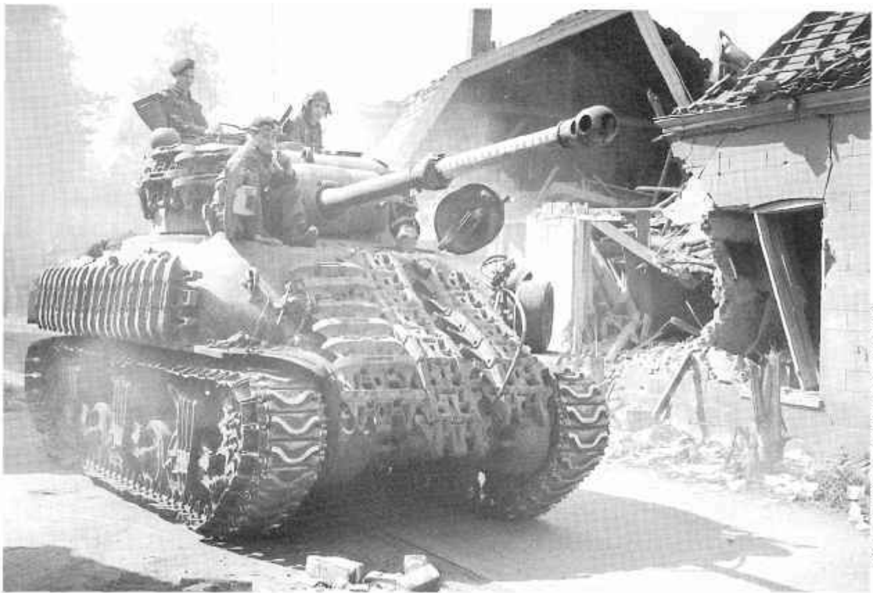
A Sherman Firefly, modified with extra armour, of the 5th Canadian Armoured Division, moves through the town of Putten, Holland, 18 April 1945.

drizzle then set in across the region, becoming a constant feature for the rest of the fighting. 20 At the same time, troops were happy to welcome the 109th Heavy Anti-Aircraft Regiment, Royal Artillery, to the area south-west of Appingedam, in an attempt to match the enemy's superior guns. They were soon joined by one battery from 1st Heavy Regiment, R.A. 21