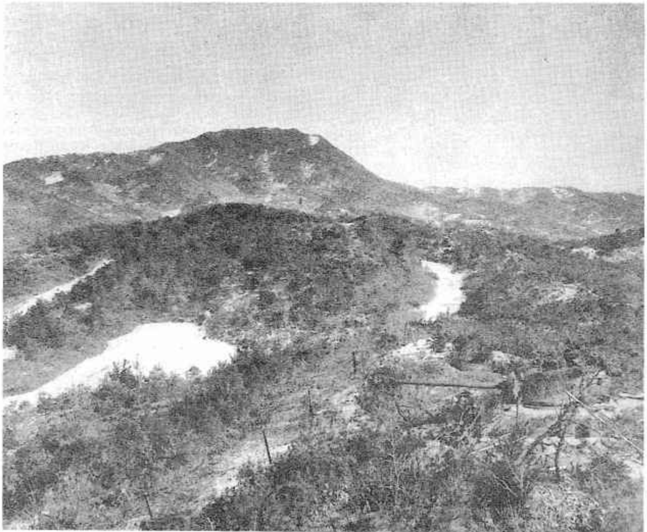
Hill 355 viewed from behind the Canadian front line. The tank visible in the bottom right corner is located to provide fire support and guard against any attempts to outflank the position.

The Canadians faced the 568th and 570th Regiments of the 190th Division of the Chinese Communist 64th Army. Although the Chinese troops suffered many hardships compared to the UN forces, 8 they were by then far better equipped than their compatriots who had suddenly appeared out of the mountains of North Korea a year before. 9 Liberally supplied by the Soviet Union, the Chinese infantry were now supported by numerous direct and indirect fire weapons, Katyusha batteries, self-propelled guns, and large numbers of mortars all well dug-in to the northwest of the Canadian positions. The evolution of the equipment mix of the Chinese troops was reflected in the nature of Canadian battle casualties. Some 52 per cent of all Canadian casualties reported up to December 1951, were caused by fragment wounds; only 33 per cent were due to small arms fire or automatic weapons. The Canadian Operational Research Team called the mortar "the commanding weapon" at that stage of the war. 10