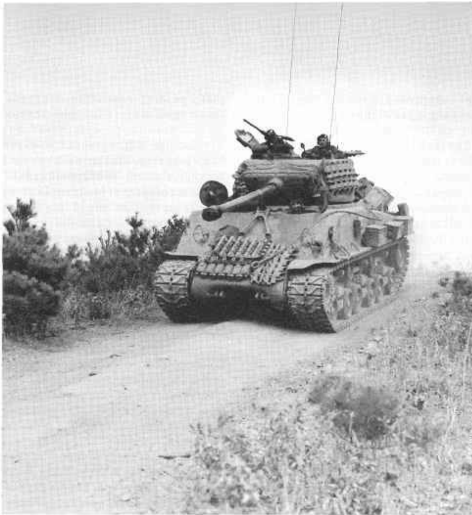
A 76 mm armed Sherman tank of the Lord Strathcona's Horse.

could have undermined an offensive spirit among the soldiers and precipitated a garrison mentality. 17 None of that applied in Korea.