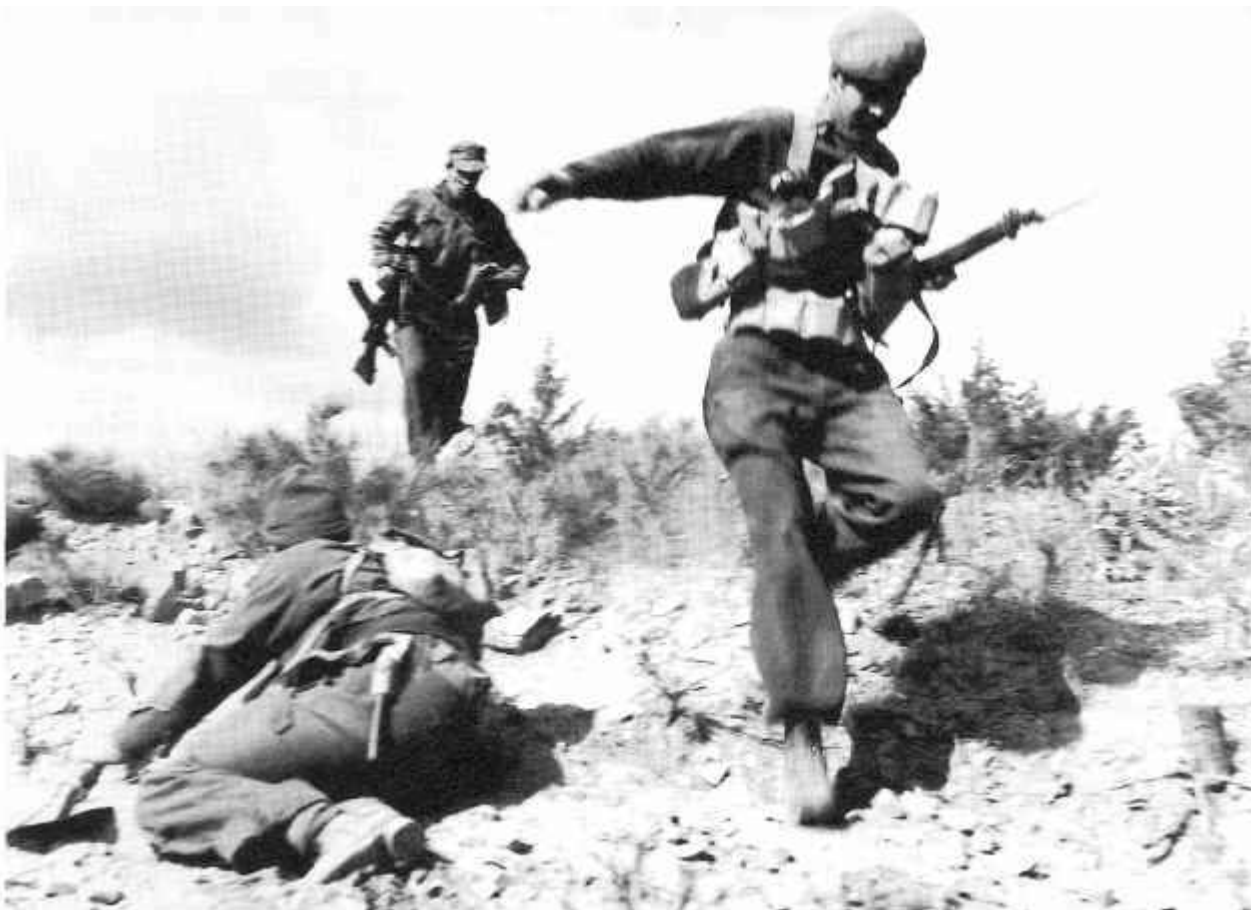
Korean combat scene with Royal 22e Régiment riflemen and Bren gunner. 23 October 1951.

emerged during Operation "Toughy." This was a raid mounted against Chinese positions on Hill 166 on the night of 9th and 10th November by two platoons of "C" Company and the Scout Platoon of 2 R22eR. The raiders crossed their start line at 2100 hours; No.8 Platoon traversed a valley to move directly north on to the objective; No.7 Platoon attempted to move to the objective from the left. It was supposed to be a textbook fire and maneuver assault, but without any artillery or tank fire preparation. The fire plan was to be used only if the Canadians encountered opposition. This they did when No.8 Platoon came under automatic weapons fire and grenades about 15 minutes after crossing the start line. The platoon sought refuge in a crawl trench some 75 to 100 metres short of the objective, a knoll below the summit of Hill 166. Setting two of his sections up as a fire base, the platoon commander tried to get on to the objective with his third section moving around to the left. That did not work either, so the objective was plastered with heavy mortars and 25-pounders while the platoon assaulted the hilltop "firing from [the] hip, throwing grenades and yelling fiercely." That worked. 33