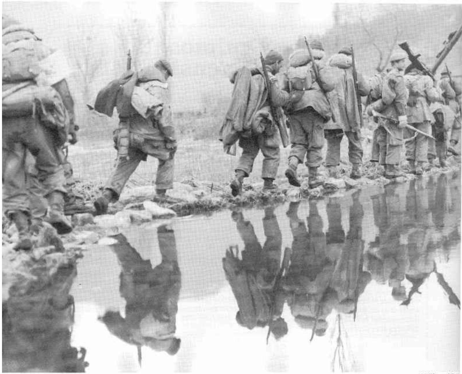
Canadian soldiers move up the line in Korea.