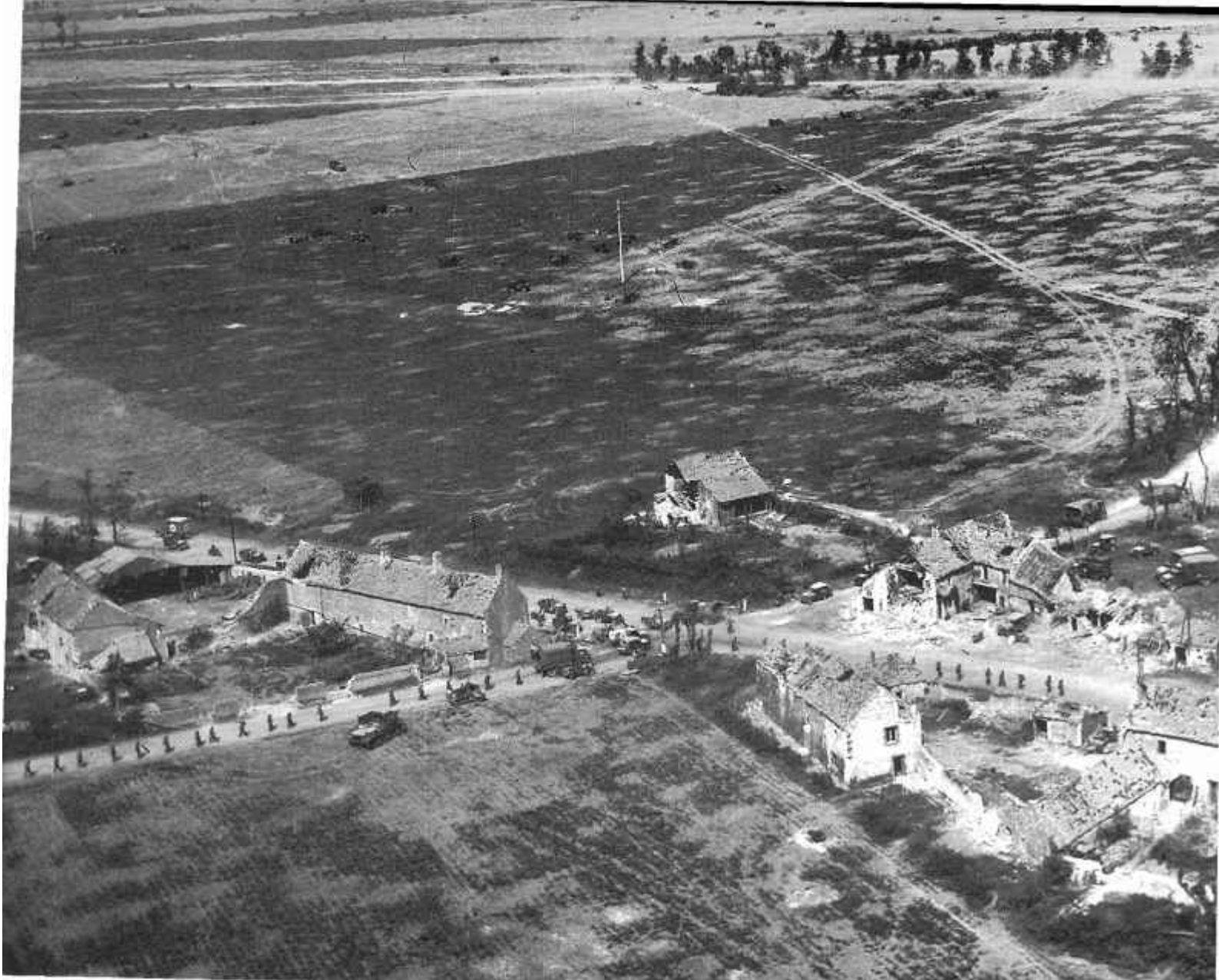
Two views of "good tank country."

Above: A crossroads on the Caen-Falaise highway. The open, rolling nature of the plain is evident. Allied vehicles cover the landscape as far as the eye can see - an 88 gunner's delight.