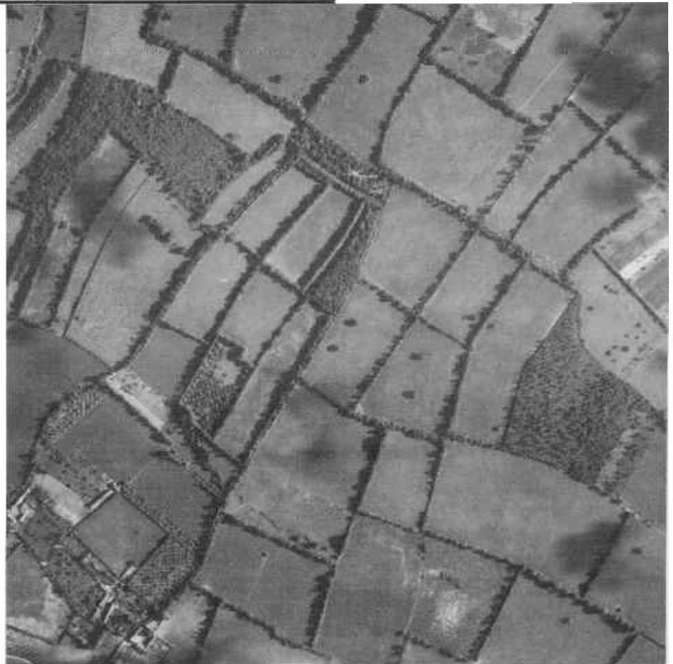
An aerial photo showing the typical bocage that covers much of Normandy. The ancient patchwork of individual fields formed by the hedgerows which bound them proved a serious tactical problem for both the American and British armies. The height of the hedgerows is indicated by the length of the shadows, in many cases, taller than the buildings at the lower left.