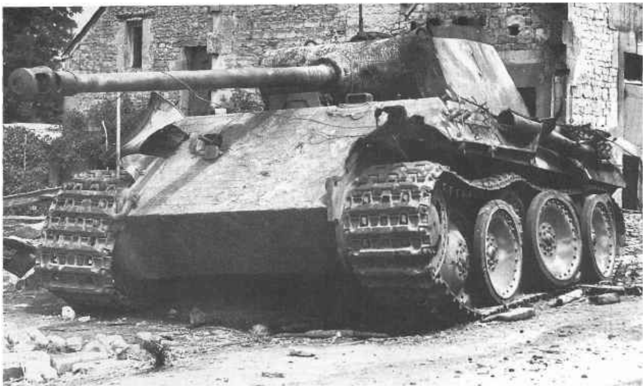
A 12th SS Panther knocked out by Canadian infantry in Bretteville-l'Orgueilleuse.

evident that offensive operations had become dangerous undertakings - a reality that would plague the Allies for the remainder of the Normandy campaign..." 17 When Kurt Meyer reported to General Geyr von Schweppenburg, commander of Panzer Group West, on 9 June that his best tanks could not budge Canadian infantry from their fortified villages, von Schweppenburg answered, "My dear Meyer, the war can only now be won through political means." 18