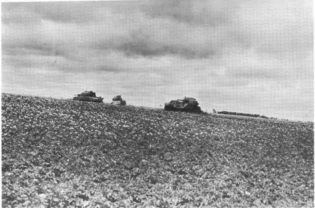
Sherman tanks of the Fort Garry Horse left to rust on a hillside near Tilly-la-Campagne. These tanks were destroyed during Operation "Spring," and this photo was taken the following year.

through the bocage, Canadian infantry surged across the open, fire-swept ground south of Caen trying to get to the enemy before the barrage lifted or they were shot down. The infantry gained a lasting foothold only in Verrières village itself. There the Royal Hamilton Light Infantry dug in about 1,000 yards from their start line and moved up their own 6-pounder anti-tank guns, while towed 17-pounders and two squadrons of British tanks were deployed in depth behind - all firing over open ground. Savage counterattacks by the 1st SS were beaten off by massed artillery, machine gun, anti-tank and tank fire. Verrières was retained, but it remained a thin salient on the crest of the ridge. To the east, along the valley of the Orne River where the enemy had excellent observation and fields of fire from across the river, the German counterattacks were more successful. Tanks, assault guns and panzer grenadiers drove as far north as the original Canadian start line on Point 67 before being driven back.