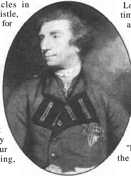
General Jeffery Amherst

The importance of this move in the history of irregular warfare is very great; it was the natural and inevitable failure of the provincial rangers to fulfil the function of acting as irregular troops. Gage's regiment constituted the first definitely light-armed regiment in the British army; the firelocks issued to them were "cut shorter and the stocks dressed to make them lighter" Composed as far as possible of woodsmen, it was officered by men who [were trained in] Rogers' methods and were also trained in regular discipline. After two years experience with local devices, the British army took partly into its own hands the function deemed to be most peculiarly American. 38