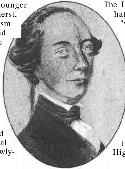
Major-General James Wolfe

Major-General James Wolfe, who served as one of Amherst's brigadiers at Louisbourg, shared his superior's belief in the utility of light infantry in North America. Wolfe was an energetic reformer in dress, tactics and training of regulars to meet the irregular warfare he knew would plague the peripheries of his siege camps around Quebec. Wolfe ordered that the ad hoc companies of light infantry, first started at Louisbourg by Amherst, remove their lace for his pending campaign against Quebec. In addition, their heavy redcoats were to be discarded in favour of their waistcoats with the sleeves of their frock coats sewn on as well as extra pockets for ball and flint. Knapsacks were to be carried higher and fastened with "a strap of web over the shoulders, as the Indians carry their pack." Cartridge boxes were to be carried hung under the left arm, powder horns issued and slung on the right, and tomahawks hung from the belt.