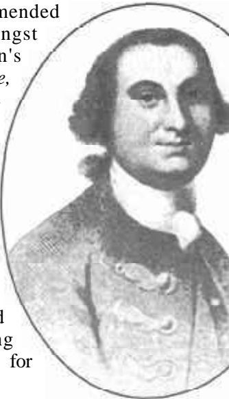
Colonel Henri Bouquet

Wolfe's Light Infantry were also instrumental in assisting the main body to get up and onto the plains of Abraham to conduct the main battle. They landed first, took Vergor's Camp and the Samos battery (both guarding the Foulon Cove) in reverse then, guided the main body to the battlefield. These important duties completed, they spent the rest of the battle guarding the vulnerable rear (Bougainville's force of 2,000 men was at Cap Rouge) of Wolfe's army and actually taking post in the line on the embattled left flank where a cloud of Canadien and Indian