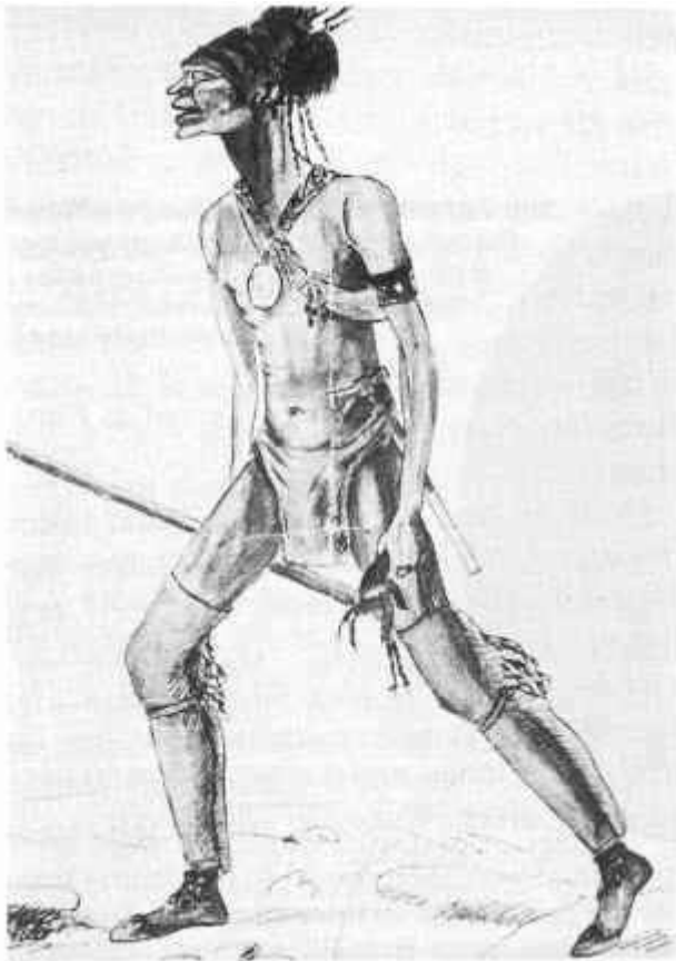
Above: Indian auxilliary with scalp, by Brigadier General George Townshend, ca. 1759.