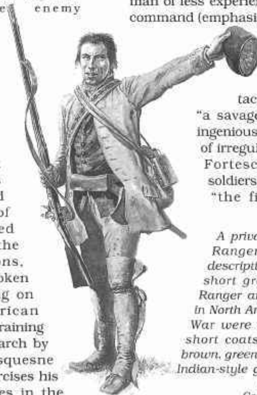
A private of Goreham's Nova Scotia Rangers according to a French description of 1755 which mentions a short grey coat and a leather cap. Ranger and light infantry units raised in North America during the Seven Years' War were usually outfitted with caps, short coats of various colour such as brown, green and blue as well as grey, with Indian-style gaiters and moccasins.

Fortescue generously gives the soldiers equal billing when he states: "the final stratagem whereby