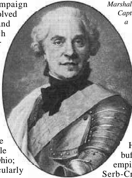
Marshal Maurice de Saxe, one of the "Great Captains" of 18 th century warfare, was a proponent of light infantry tactics. (Print after a 1748 portrait by Quentin de La Tour.)

expeditions." 16 Thus, a long campaign to distant fields that also involved meeting Indian tactics of stealth and ambush, was one for which colonial militias (except ranger units recruited exclusively from frontiersmen) were eminently unsuited and, moreover, one in which they were unwilling to participate. Governor Robert Dinwiddie, however, knew where to find men to meet the challenge. He wrote to his friend James Abercromby in England: "I am still of Opinion without force from Home, we shall hardly be able to drive the French from the Ohio; we want Military Men, and particularly Engineers." 17