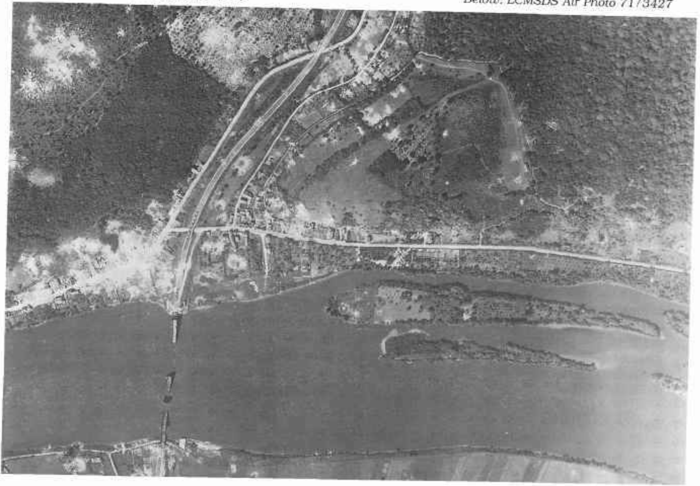
Below: LCMSDS Air Photo 71/3427