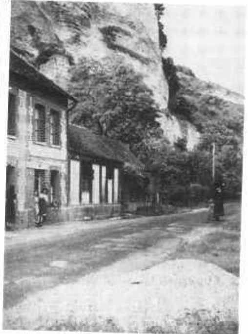
Left: Port de Gravier looking south back along the road 4th Brigade used to approach the town. The precariousness of the river road is apparent with the river on one side and sheers cliffs on the other. The rail overpass at the centre of the photo marks the place where the Royal Hamilton Light Infantry missed a turn in the road and walked into a road block. By necessity, the Essex Scottish assumed the lead and shortly thereafter were attacked by the Germans. Right: The defile where the Support Company vehicles were trapped and mortared just outside of Port du Gravier.

where more cover existed. Both commanders reported by radio to Battalion HQ that the entire river road was covered by fixed, probably ranged-in fire, lines of fire and not likely manned by some "hit and run" rearguard. The cunning Jerries had effectively "let slip in" the best parts of two infantry battalions, certainly into temporary "dead-ends" (if aided by a simple map reading error), and now if he possessed heavy enough guns could "lock in our rear" by blocking us with our own destroyed vehicles. This he momentarily accomplished!