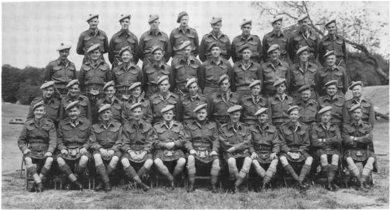
Officers of the Essex Scottish Regiment, England, June 1944.