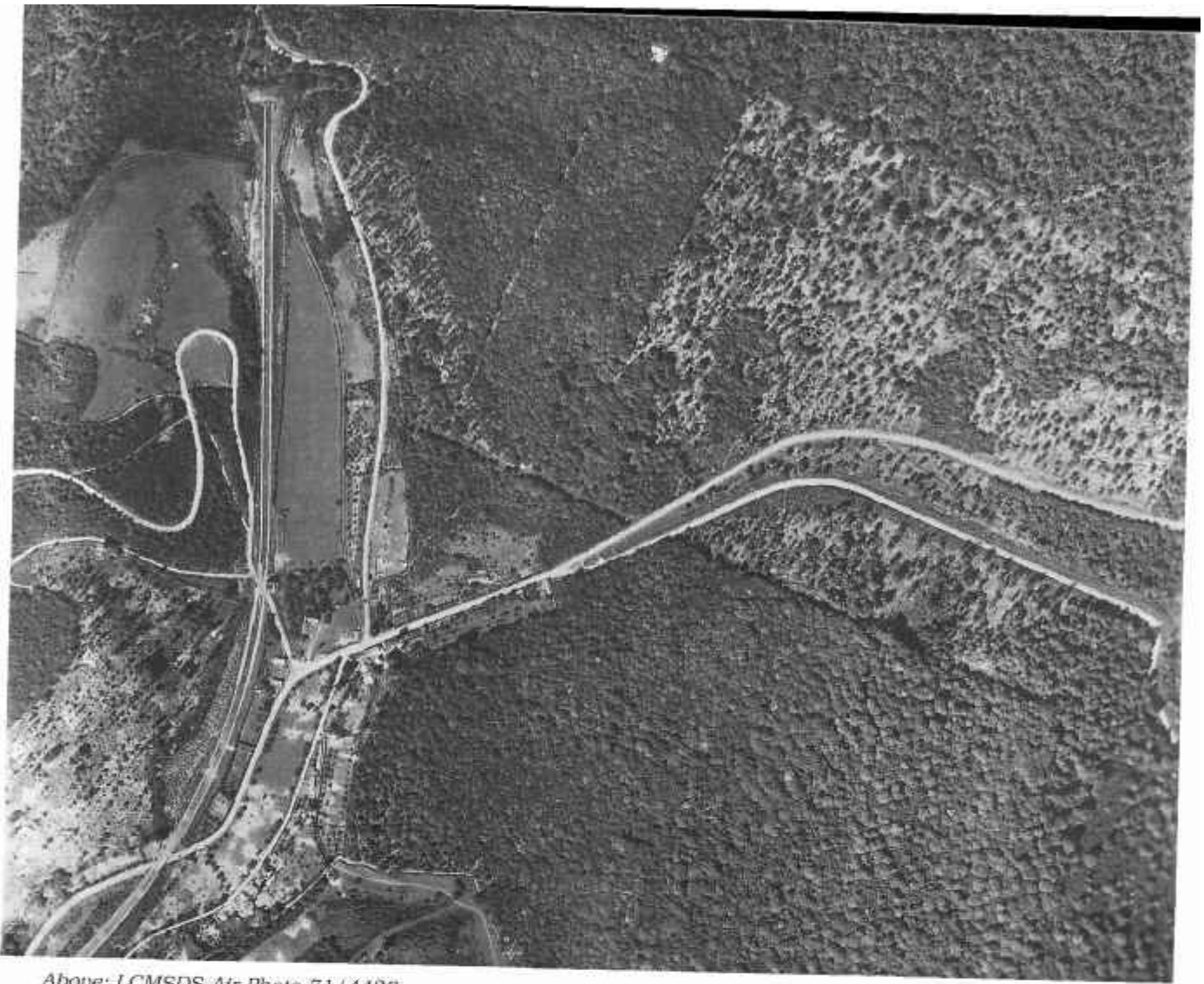
Above: LCMSDS Air Photo 71/4429