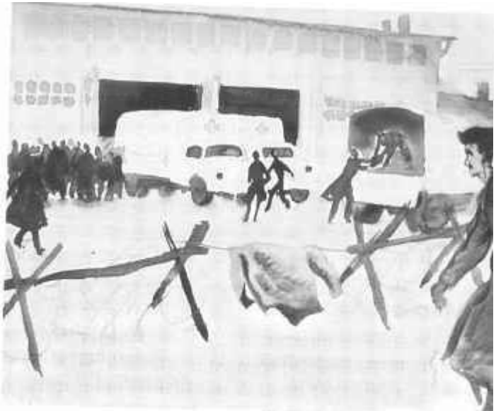
Unloading Red Cross Trucks, Lubeck, May 1945 watercolour on paper 20.5 x 24.6 cm, CWM CN80095