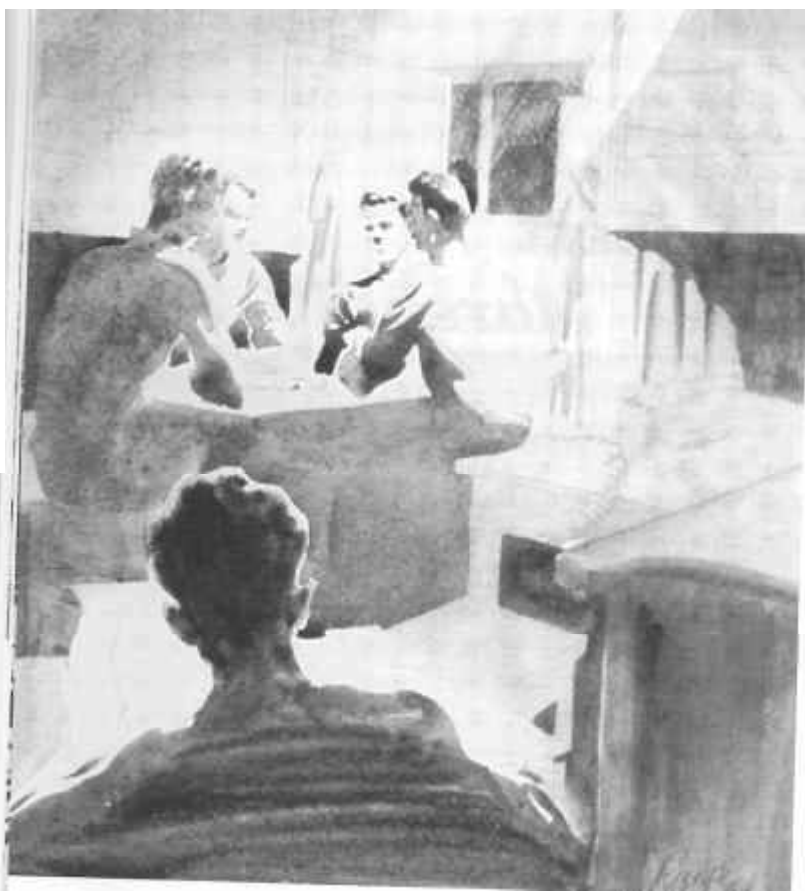
A Forty-Watt Bulb and a Deck of Cards (above) watercolour on paper 37.5 x 22.7 cm CWM CN80089