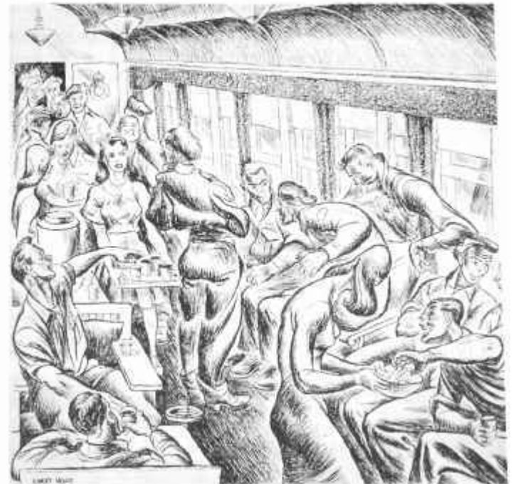
Above: Legion Car pencil, ink on art board 39.5 x 43.3 CWMAN19929909-012