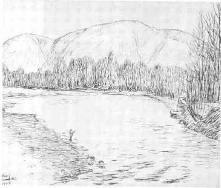
Vedder River, Chilliwack, B.C. ink on paper 27.0 x 34.0 cm CWM AN 19940045-040