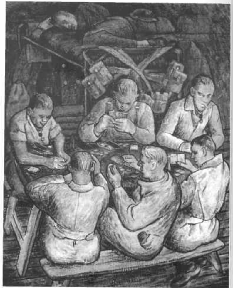
Off-Hours egg tempera on cardboard 77.0 x 60.0 cm CWM AN 19930074-001