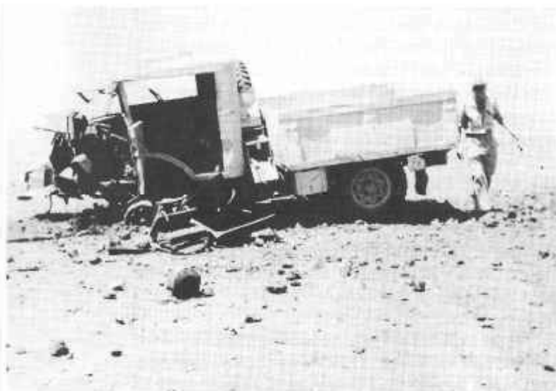
CFPU PMR 529