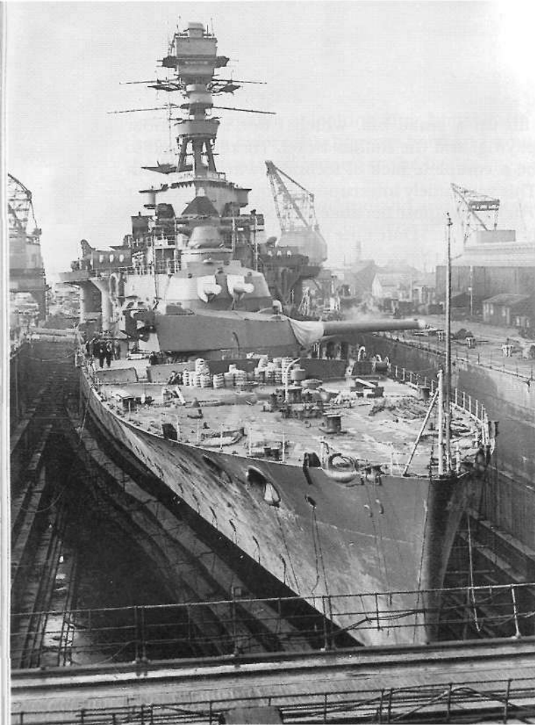
HMS Repulse undergoing refit at Portsmouth, ca. 1936.

I read the book, The Battleship so this still remains a mystery in my mind. During the night the 281 air warning radar had been shut down by a policy of radar silence.