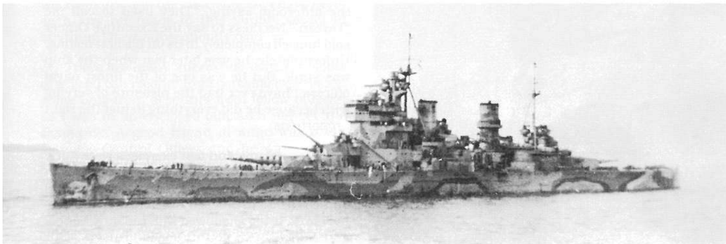
HMS Prince of Wales

been to sea before. I was the only technician; there were no technicians trained at that time in the Royal Navy for radar duties. Needless to say I found myself with my head inside a radar set almost continuously with maybe 40% of the sets not functioning at any one moment. Right from the outset I decided the type 281 would receive top priority, the gunnery sets would follow as best they could, with type 282s having the lowest priority. I didn't receive much direction because in those days nobody really knew much about radar and you found two things happen: one, you had to convince somebody it was worth carrying and when that was achieved, you had to convince them that it couldn't tell you what