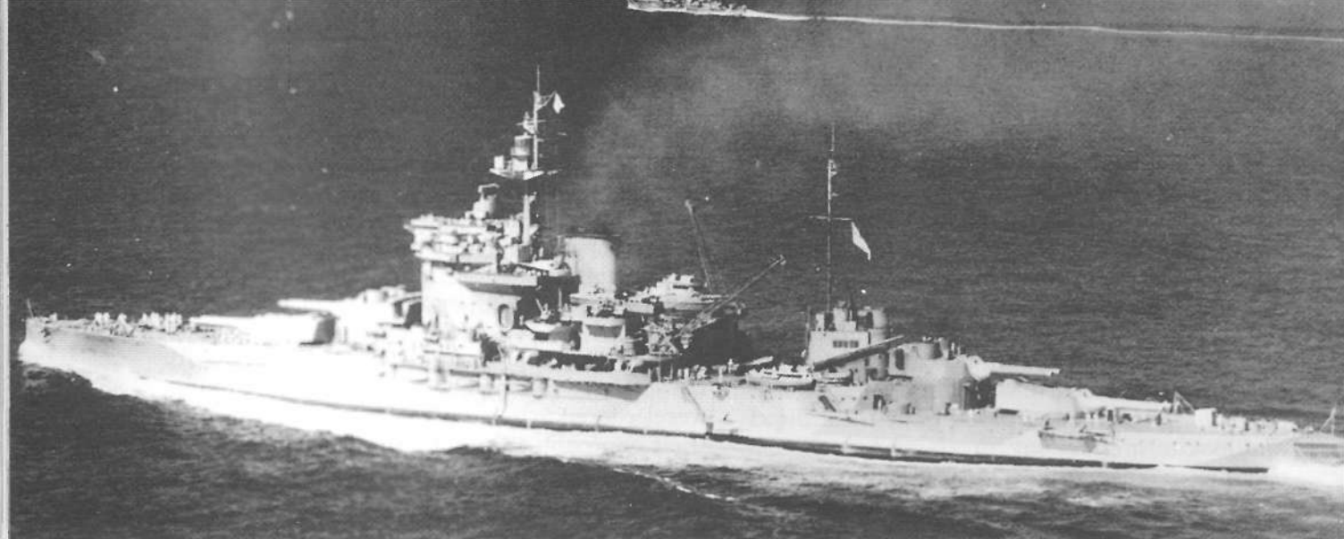
HMS Warspite, November 1942.

Twenty minutes after the envoy had returned the French had not surrendered. The Admiral sent the envoy ashore again and said, "If you do not surrender within twenty minutes, I will open fire this time." The time, of course, passed by and still the French did not surrender. Just at that moment when the morning watch was turning over to the forenoon watch and gunlayer A was not in his seat, the French fired one shot. Of course, none of Warspite's guncrew were in a position to fire at this moment, but as soon as the French had fired the one shot, a myriad of white flags went up ashore and they surrendered. That was the battle of Tamatave. One shot was fired by them and that was all.