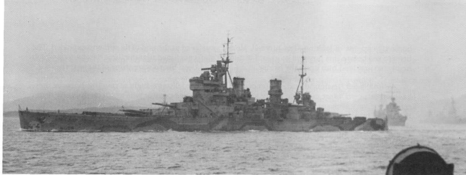
HMS Prince of Wales leaving Placentia, NFLD, after the Churchill-Roosevelt meeting, August 1941.