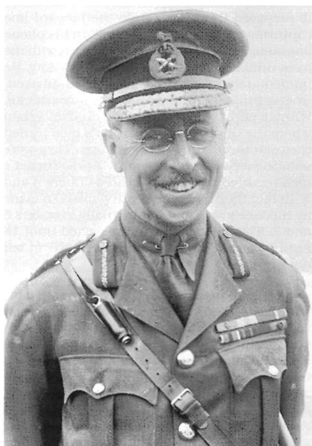
A smiling Turner shown shortly after his promotion to Lieutenant-General in mid-1917. The ribbon for Turner's VC is clearly visible above his left breast pocket.

On 1 April Plumer accelerated Turner's relief of Haldane's exhausted division by 48 hours. The relief was complicated by the Canadian Government's request that its Corps remain intact. Thus Plumer had to relieve Fanshawe's V Corps with Alderson's Canadian Corps; the British Army's first corps-for-corps relief of the war. Turner relieved Haldane on the night of 3/4 April without incident. 41