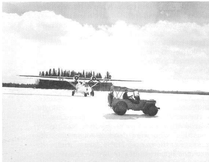
NAC PA 195908