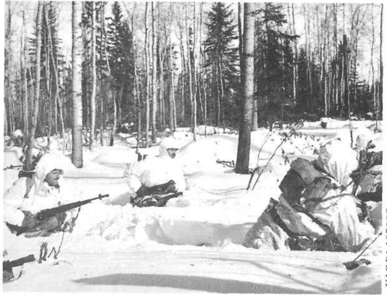
NAC PA 195906