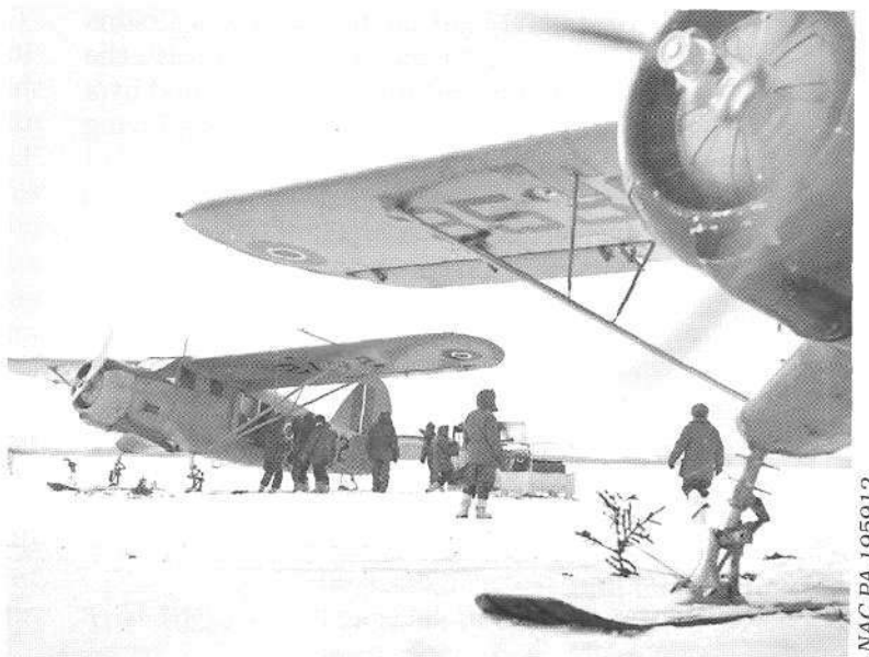
NAC PA 195912