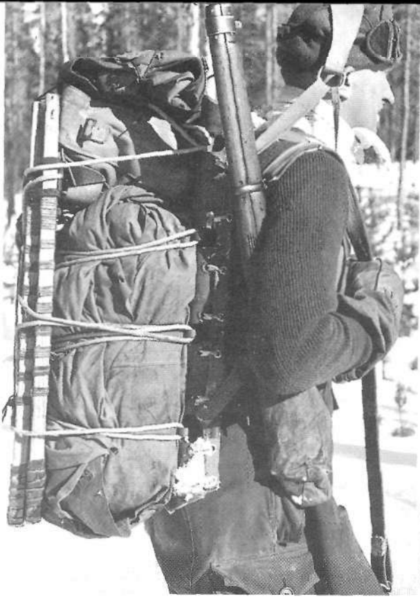
NAC PA 195901