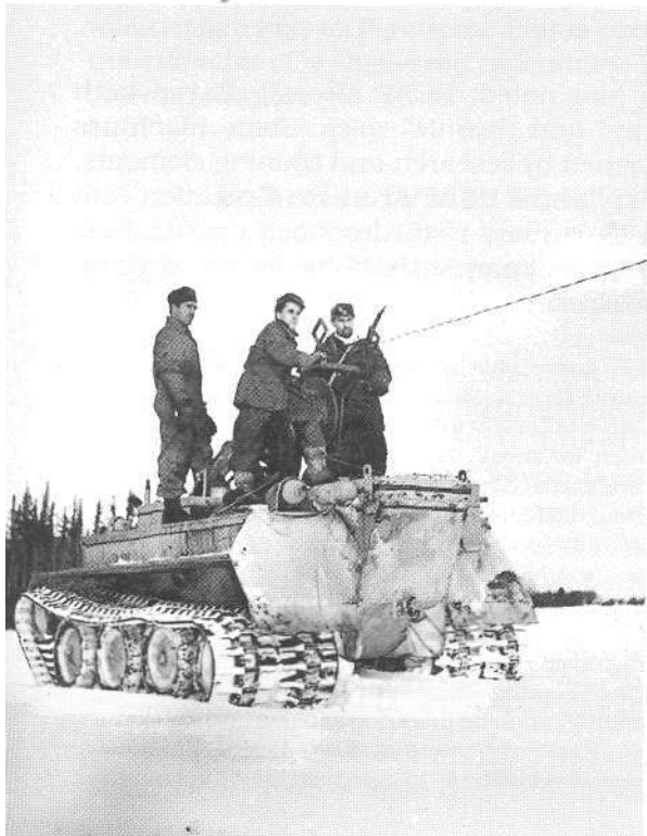
NAC PA 195904