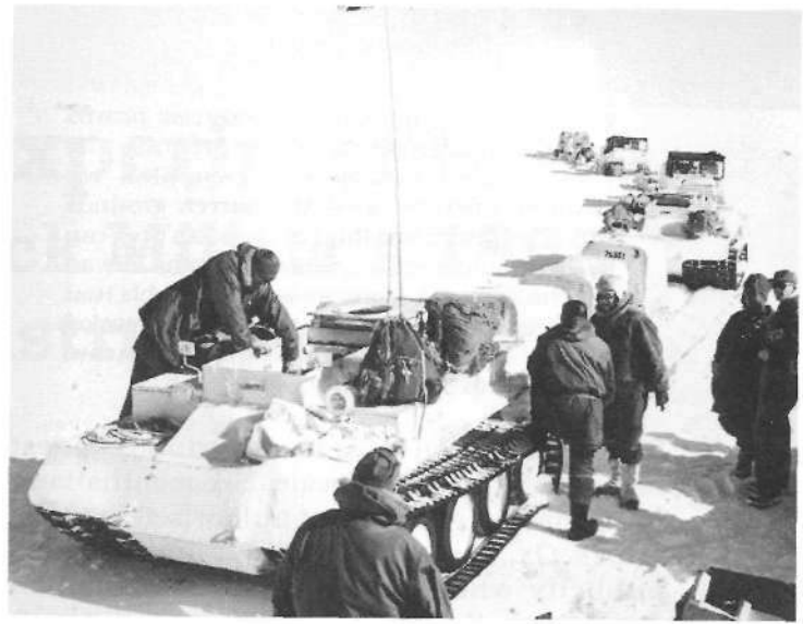
Exercise "Lemming": Assorted vehicles on sea ice near Churchill, MB (above), and mounting a pressure ridge (below).