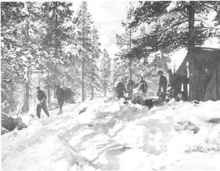
NAC PA 195910