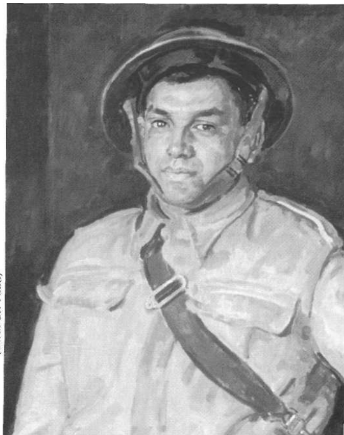
Figure 4: "A Redskin in the Canadian Royal Artillery"