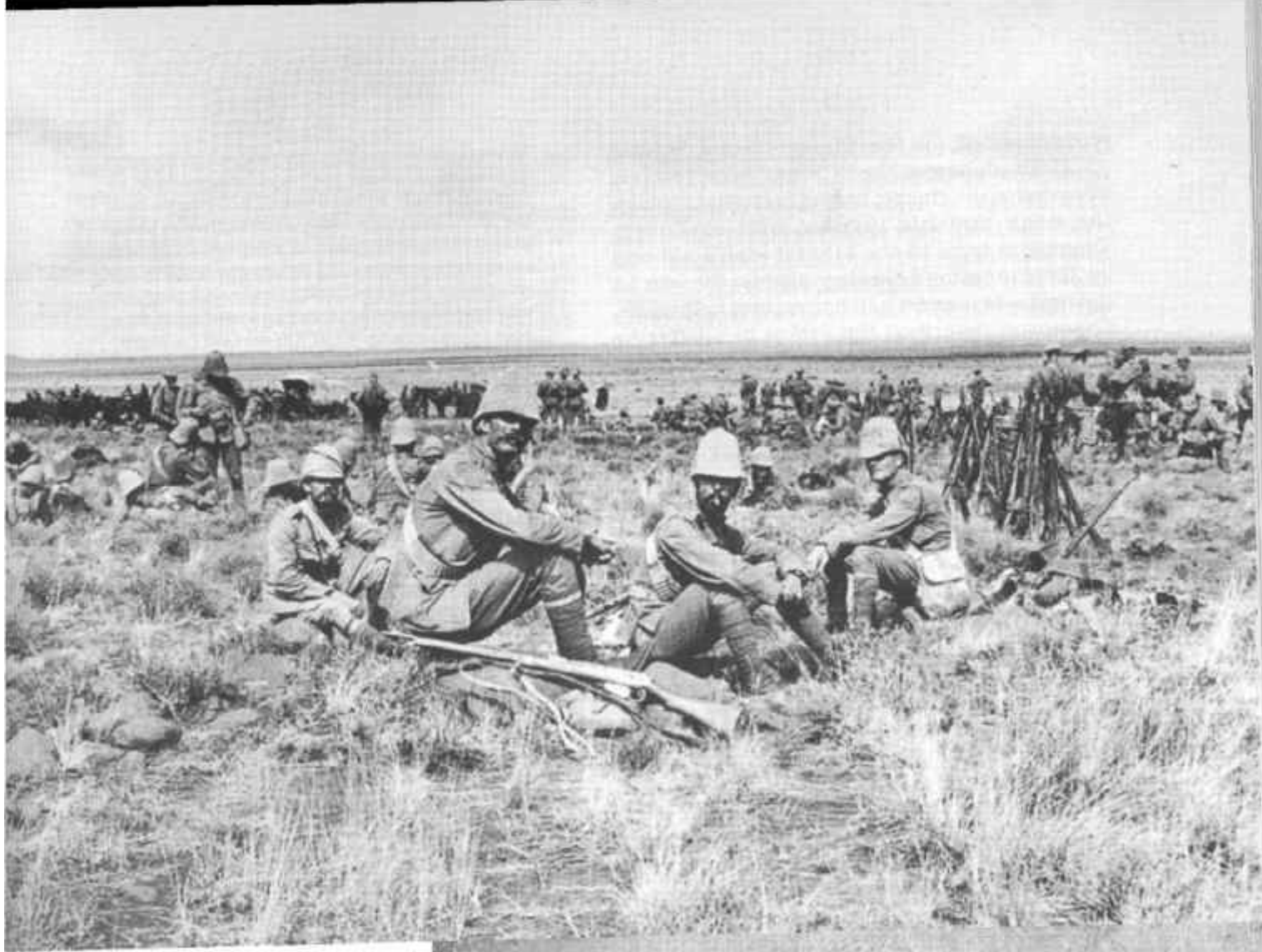
Above: A group of soldiers from the Royal Canadian Regiment rest on their way to Paardeberg, February 1900.