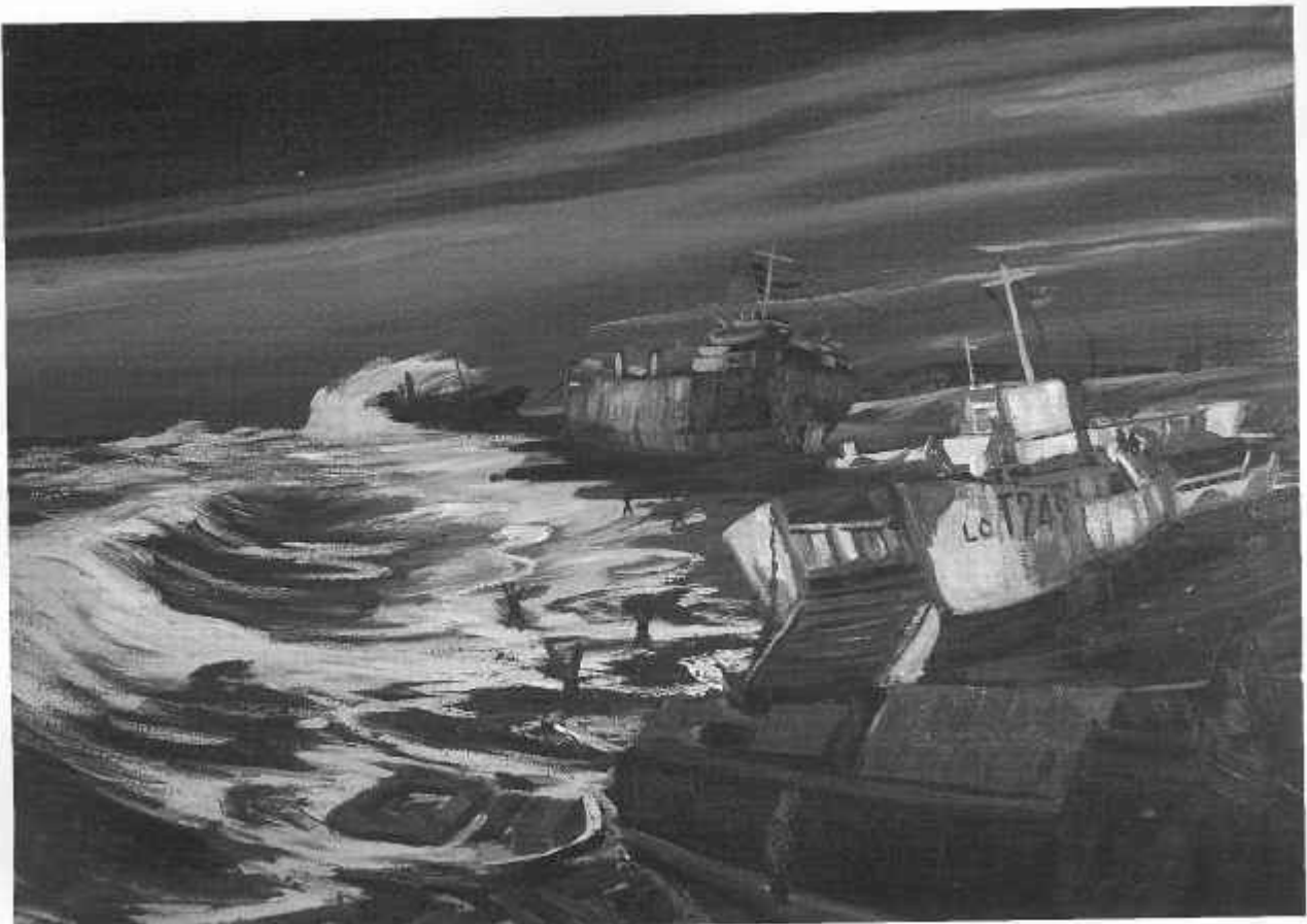
The Gale of Hurricane Force on the Normandy Beach.