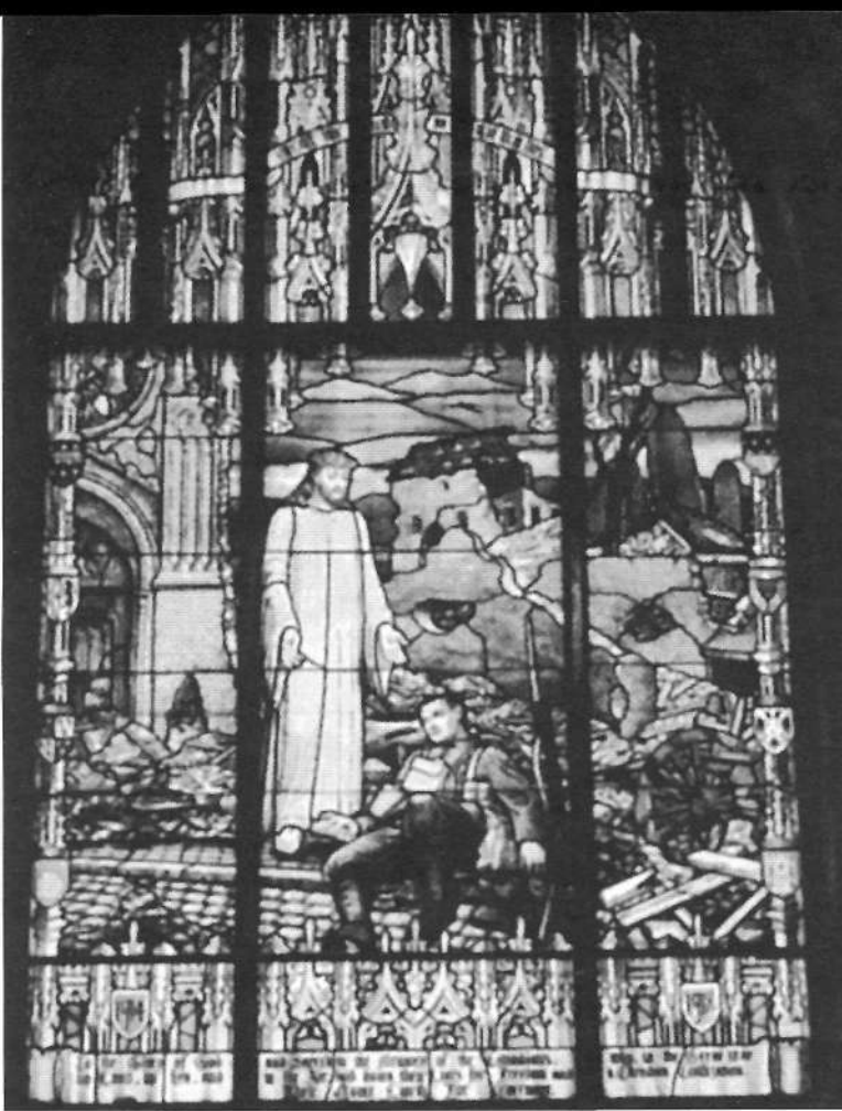
The memorial window formerly in Carmichael United Church in Regina. When the church was closed, plans were made to move the window to the armouries in Regina, where it is to be unveiled on Remembrance Day 1996.