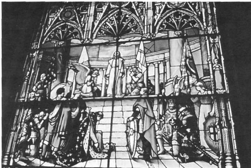
The memorial window in the Anglican Church of the Ascension in Montreal. The symbols of English and French power are intermingled, but are easily recognizable by their devices. Britannia stands to the right, and the Black Prince stands in the centre right, holding a shield.