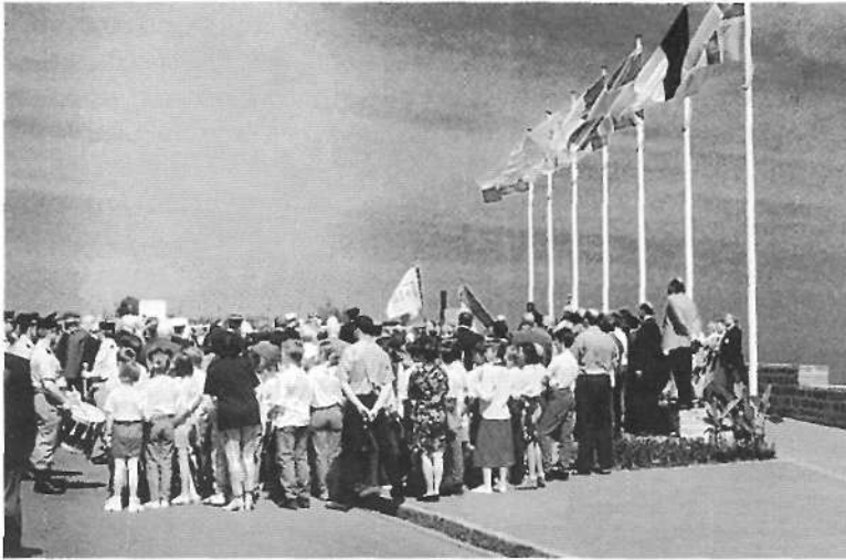
D-Day commemoration ceremonies at St. Aubin-sur-Mer, 6 June 1996.