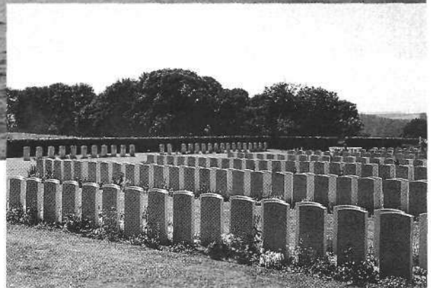
Right: The Canadian war cemetery at Dieppe with its back-to-back headstones.