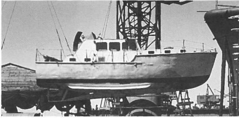
An ice-battered Pogo in Halifax after her first voyage through the Northwest Passage. Her newly attached wing keels are visible just below the waterline, May 1955.