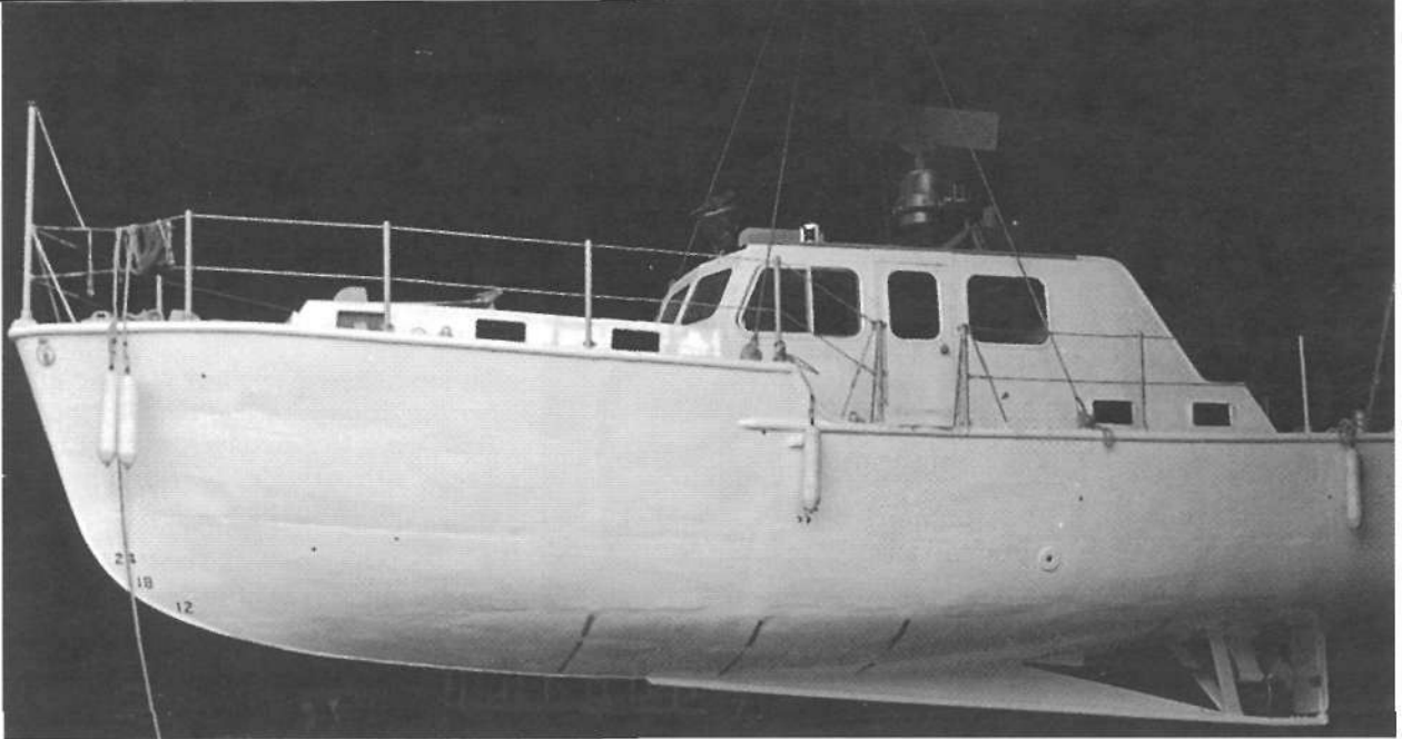
The completed hydrographic survey launch Pogo leaving the Design & Engineering shop floor for trials in the St. Lawrence River, June 1954. Note that she carries the Labrador's crest on her bow.