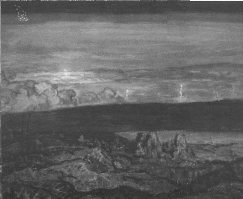
Figure 3 (bottom left) Ablain Saint Nazaire (I) (1918) A.Y. Jackson (21.7 x 26.7 cm; Oil on panel; Canadian War Museum CN 8211)