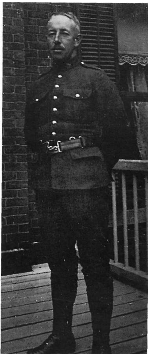
Figure 1: A.Y. Jackson, Montreal 1915.

In addition to offering an honourable escape from active service, a motive not to be underestimated or disparaged after the massive loss of life during the battles of Ypres and the Somme, a commission as a war artist offered Jackson an "opportunity to paint again." During his earlier service as an army private, Jackson's artistic experience was employed only in drawing "a few diagrams and enlargements from maps" of the sector of the front line in which he served. "I had no chance of doing any sketching," he later