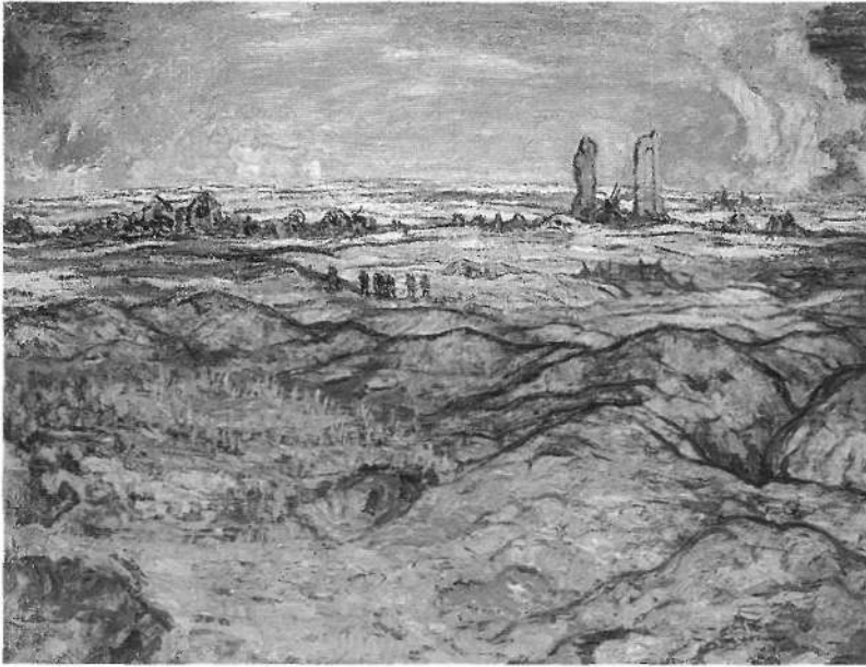
Figure 2 Cite Jeanne d'Arc: Hill 70 in the Distance (1918) A.Y. Jackson (86.7 x 112.5 cm; Oil on canvas; Canadian War Museum CN 8205)

serve as a guide" for what he was to paint. "I had no interest in painting the horrors of war and I wasted a lot of canvas," he wrote. Yet, "the old heroics, the death and glory stuff," were not an option either. "There was no more Thin Red Line" or "Scotland For Ever," he wrote, and "the old type of factual painting had been superseded by good photography." Also, Jackson felt that the "visual impressions [of war] were not enough," and were "ineffective" in painting the experience of war. 17 In truth, Jackson seems to have spent his first months as a war artist groping for a style that he deemed appropriate to the grim circumstances of the Western Front.