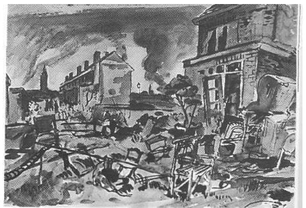
Bottom: Spring in Arnhem (Watercolour; CWM CN 14003)