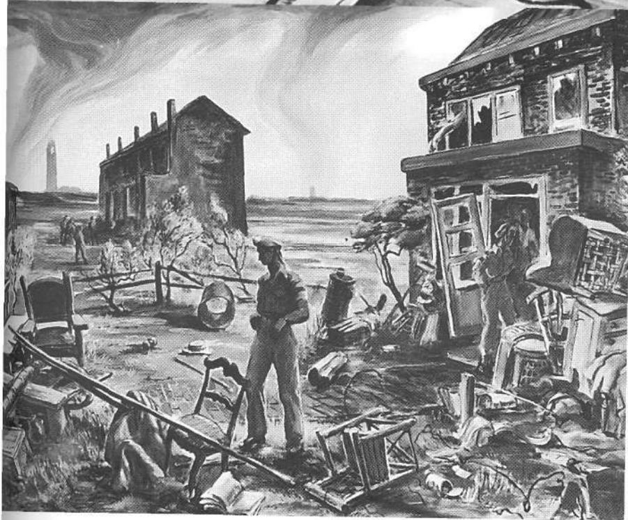
Left: Spring in Arnhem, Holland, 1945 (101.7 x 76.4 cm; mixed media; CWM CN 14002)