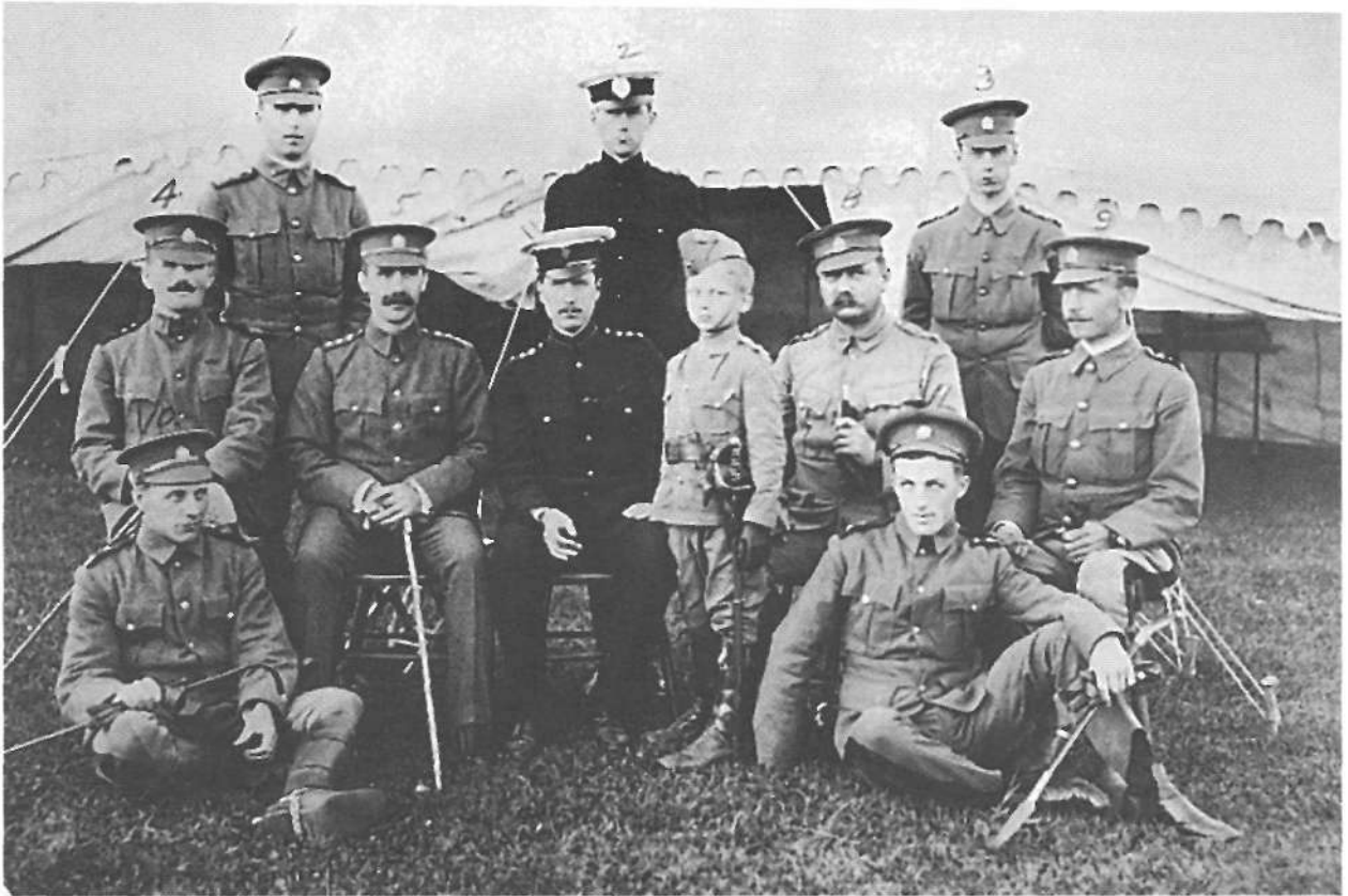
Officers of the Canadian Corps of Guides, Cobourg, Ontario, 1906.