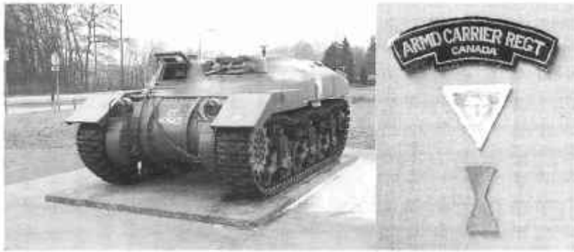
Left: Ram Kangaroo Memorial to 1st Canadian Armoured Personnel Carrier Regiment in Mill, The Netherlands. Right - Top: Woven orange on black ARMD CARRIER REGT/CANADA regimental shoulderpatch, the colours represent orange for the Dutch Royal family and black for the Armoured Corps. Middle: Printed yellow triangle with black outline with a black bull's head superimposed in the centre, the tips of the horn are orange and the nostrils are red; this is the distinctive British 79th Armoured Division tactical sign and shoulder patch. Bottom: Melton green 31st Brigade diablo, the brigade shoulder patch.