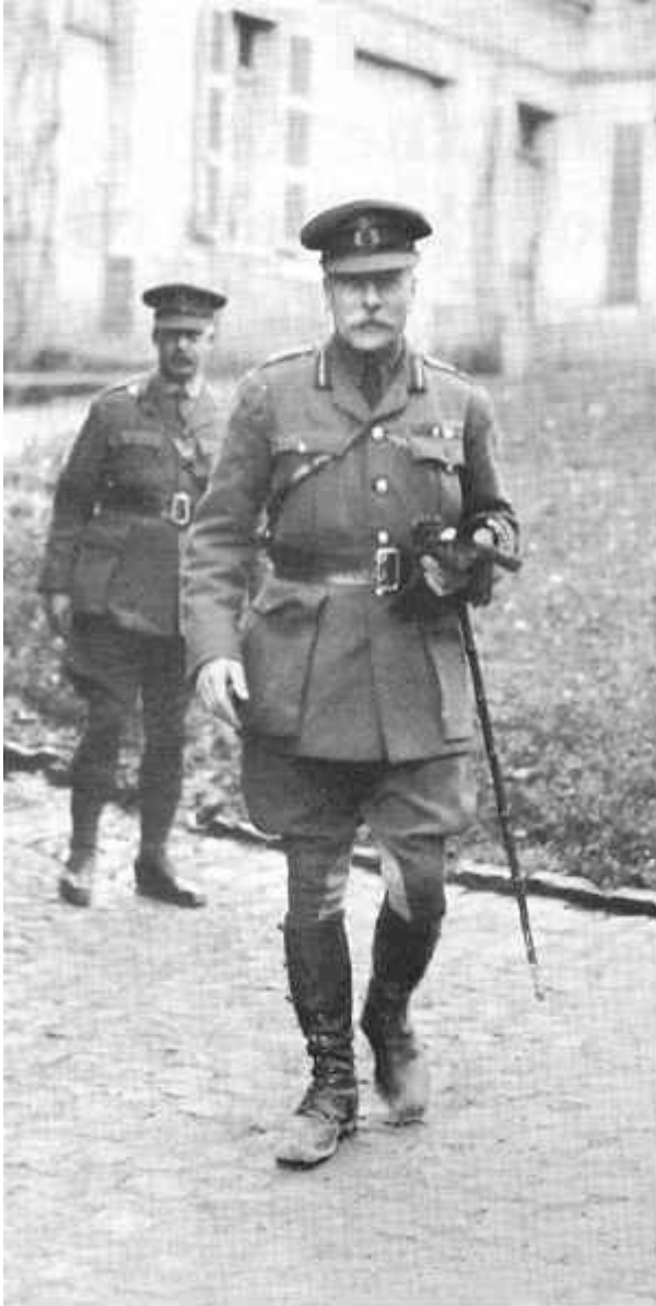
Field Marshal Sir Douglas Haig leaving 3rd Canadian Divisional Headquarters, February 1918.

Canada. This organization operated as a focal point for discussion and social activities, which reflected the peacetime conditions under which it was conceived. With the ever expanding volume of returned and disabled veterans arriving in Canada from the latter half of 1916, it became evident that both private and government structures were ill-equipped to meet the previously unimagined needs of these individuals. In response to these new challenges, 14 national