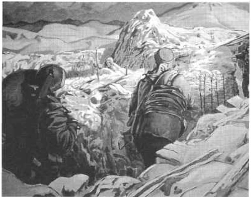
Welcome Party by E.F. Zuber (CWM CN 90026)

It is from the artifact standpoint, however, that the project draws the most criticism. While the planning, design, construction, etc. match or exceed that already in place throughout the museum, the actual content falls short of initial expectations. Nothing can replace real artifacts and the fact that a mere three items on display were actually in Korea leaves the Museum, in one sense, shortchanging the visitor. The lesson to be learned from this experience is simple, though not always achievable. Exhibits cannot rely solely on secondary/supporting material and must include genuine artifacts if they are to bear the hallmark of authenticity.