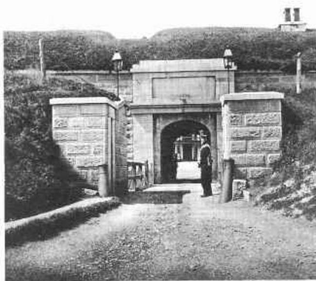
Left: Gateway at the Halifax Citadel, ca. 1880.