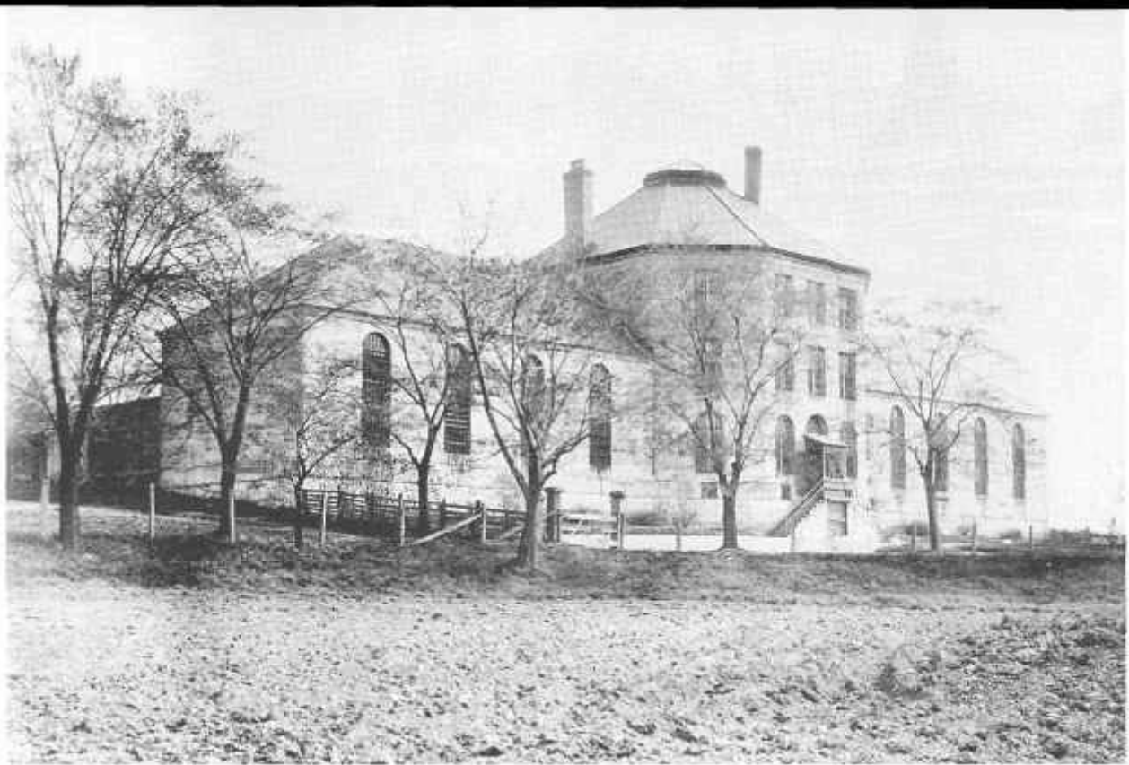
Rockhead City Prison. Opened in 1860, Rockhead remained the major place of confinement for those convicted of city crimes into the 1960s. During the 19th Century a goodly portion of its inmates were soldiers of the British garrison. Around its walls swirled the "Battle of Rockhead" of 1871.