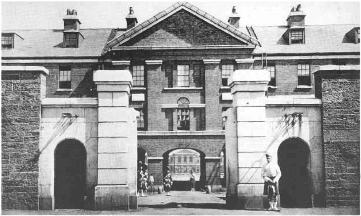
Above: The entrance to Wellington Barracks, ca. 1870. The Citadel and Wellington Barracks were the British garrison's two main infantry barracks at this time. The first building inside housed the rank and file; the building further in, visible through the archway, housed the officers. At this time the barracks were occupied by the 78th Highland Regiment of Foot. One of its members can be seen standing outside in walking out dress; members of the barracks guard in full dress can be seen inside the gate.