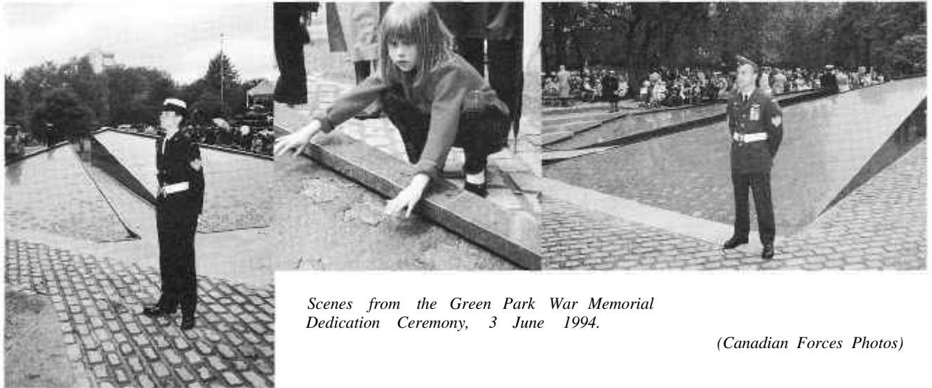
Scenes from the Green Park War Memorial Dedication Ceremony, 3 June 1994.