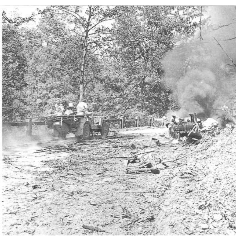
A Jeep Ambulance of 9 Field Ambulance passes the wreck of a German lorry knocked out by West Nova mortar fire south of Anzi after a German engineer detail was caught in the act of blowing a bridge.

The newly formed obstacle was easily bypassed and by this time the heavy vehicles had caught up, so once again, the armour took up the lead, with the adrenaline-charged soldiers of "A" Company riding on top. The last town that would be passed through before reaching Potenza was Anzi, with 17 miles separating them. The leading tanks found another destroyed bridge just outside of Anzi at about midday on 19 September, but a diversion was easily constructed and once again the troops pushed on. In the town itself, contact was made with more German sappers who had been sowing Teller mines in the road, only this time it was the gunner of the lead Sherman who was the quickest on the draw . 15 Several 75-millimetre shells were hurled at three German lorries which promptly collected their passengers and scuttled off. "Thus hustled, the enemy had no time for elaborate demolitions or properly to conceal the mines," 16 which, left unburied, were easily dealt with by the Canadian engineers, and "Boforce" continued on. Only a short time after sundown, at 1930 hours, 19 September, the force had reached the high ground overlooking the Basento River valley, and the town of Potenza.