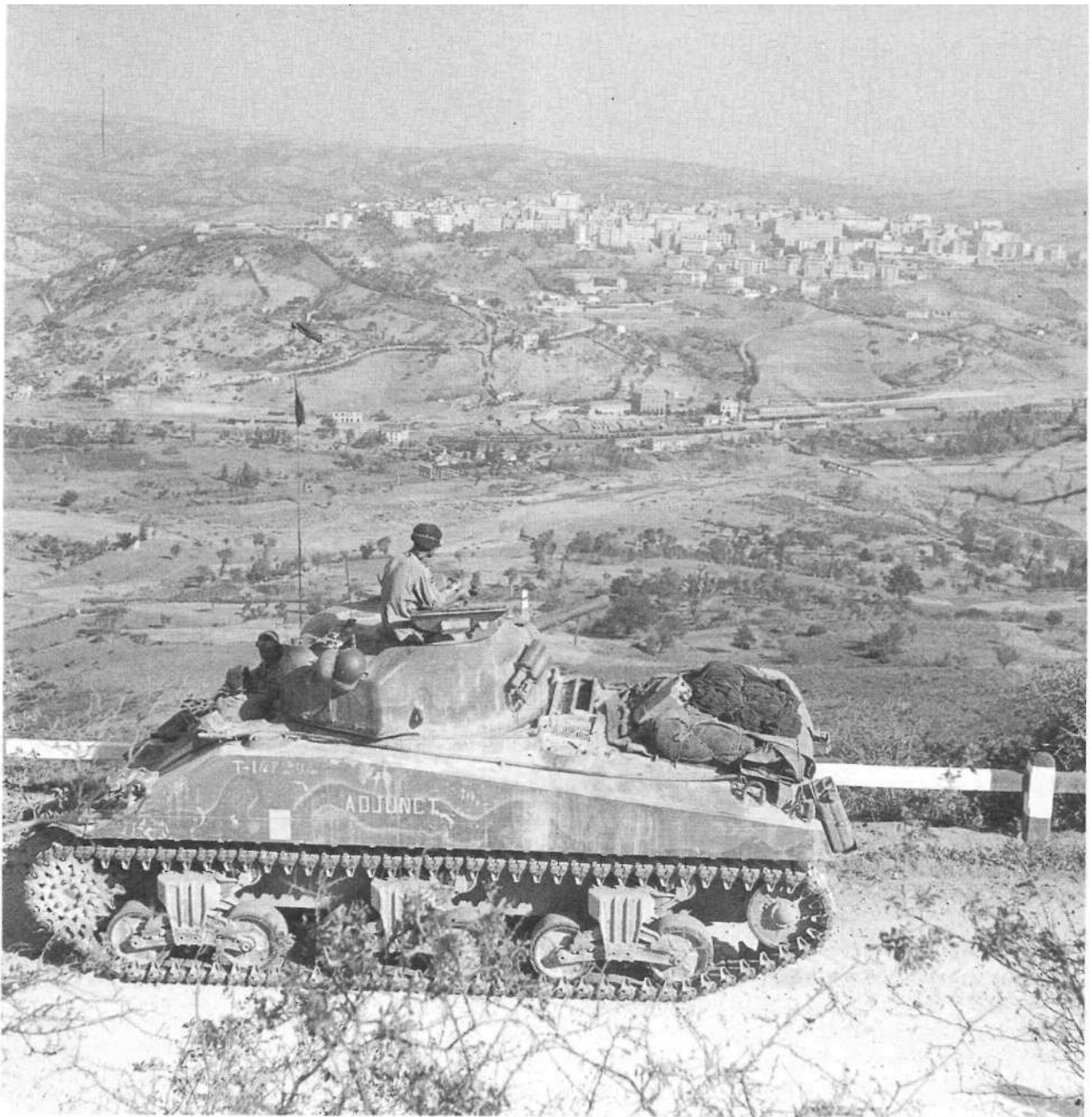
"Adjunct" of "A" Squadron, The Calgary Regiment, overlooking Potenza. In the centre of the photo can be seen the railyard where the lead companies came under heavy fire. The bridges over the dry bed of the Basento can also be seen. 20 September 1943.

advantages of observation, which could potentially serve to annihilate a daylight assault, General Simonds ordered "Boforce" to make a grab for the town that very night. 19