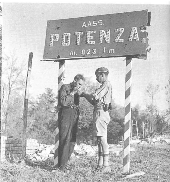
Left. A Medium Machine Gun of the Saskatoon Light Infantry harasses German paratroopers defending Potenza. Right: A Canadian army photographer lights the cigarette of an Italian civilian who hid a downed American airman in his home near Potenza.

support "D" and "C" Companies. 33 The principal effort would be shifted to the east where the Royal 22e Regiment, which arrived during the night, would carry out a wide flanking movement on the Canadian right, to seize the heights behind the town. 34 Such an attack over relatively open ground would be more easily supported by artillery. The fire of all three batteries of the Royal Canadian Horse Artillery's 1st Field Regiment was to assist the Vandoos' attack. 35 The Carleton and York Regiment was in reserve. 36