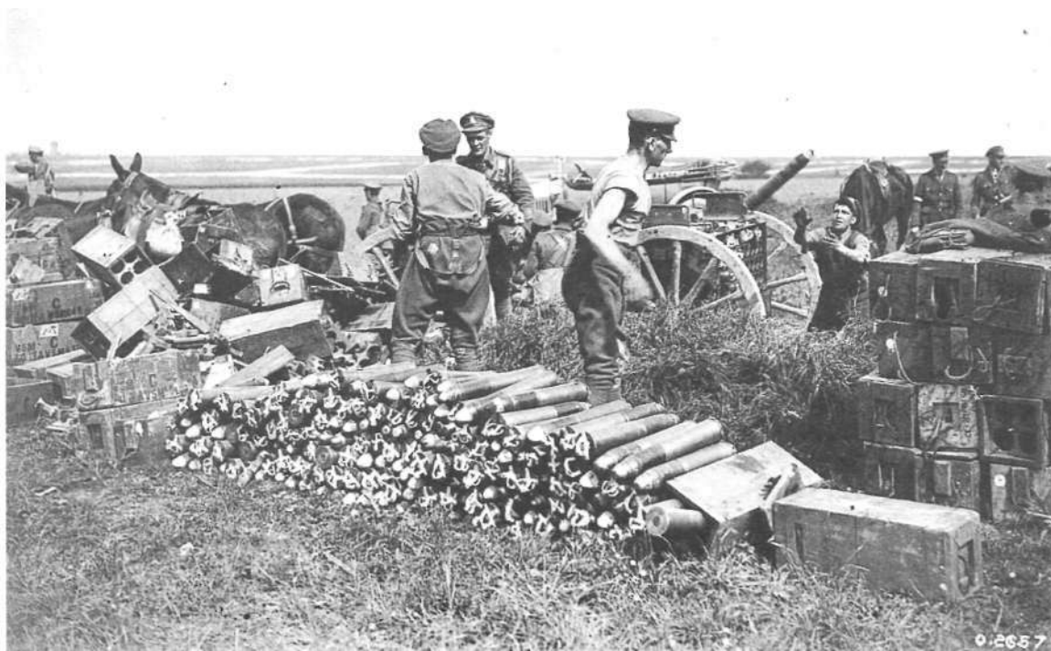
Canadian artillerymen loading their limbers from a dump by the roadside, May 1918. Note the soldier on the right by the wheel preparing to catch the shell which has just been tossed to him.

When he had trained in England in October and November, it had rained every night. Sir Sam Hughes had his outfit in tents on Caesar's Plains. He tried to get his men placed in barracks, and had some big brass down to review his outfit. They hovered over his men and congratulated him on having such a robust Canadian regiment that could stand it to be in tents. They could not however, get barracks for them. The men had been standing at attention in front of the individual tents. The big brass ordered stand at ease. Sam called them to attention again. He roared out: