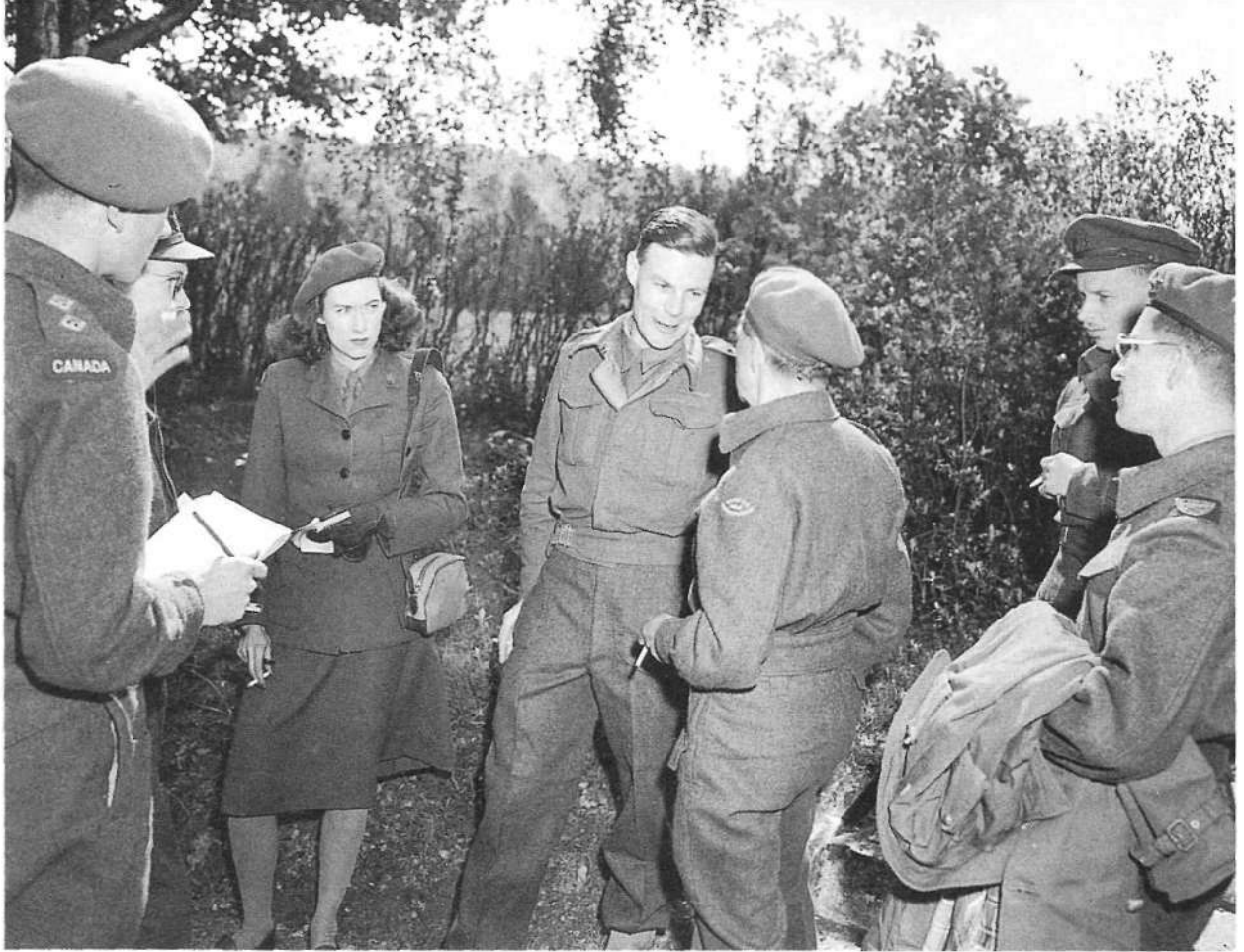
Lieutenant-Colonel C. C. Merritt, VC, being interviewed by correspondents shortly after his release from a prisoner of war camp, 21 April 1945. The award of a decoration, even a VC, to someone who had been taken prisoner was unusual.