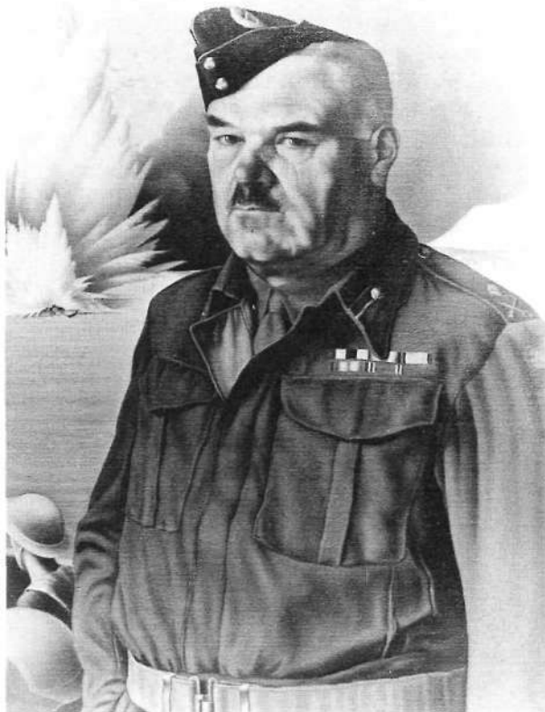
Major-General J.H. Roberts A portrait by Lawren P. Harris, who was commissioned soon after the raid to paint Roberts and one decorated member of each of the participating regiments.

1942, he despatched his recommendations to First Canadian Corps. The honours involved were approximately those as finally published in the London Gazette (see above), although his initial suggestions were for seven rather than eight DSOs (the eighth, to Roberts himself, would be added by higher authorities); he submitted 25 names for Military Crosses (only 16 were gazetted) while the number of DCMs recommended was fourteen (twelve gazetted). Roberts requested 44 Military Medal awards; the number granted was 45. His suggested 100 Mentions in Despatches were reduced in the London Gazette to 91.