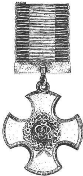
The Distinguished Service Order

In the case of the Camerons of Canada a recommendation for one additional DSO to a prisoner cannot be dealt with while the officer remains in enemy hands.