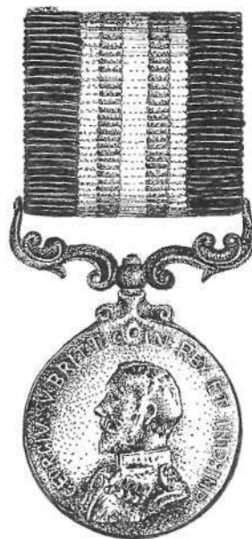
The Military Medal

The distribution of military honours following the Dieppe Raid is but one instance of how such awards were made. Authorities were concerned with striking proper balances; restrictive policies might leave courage unrecognized; excessive generosity risked dilution of the honours themselves. There were unwritten rules designed