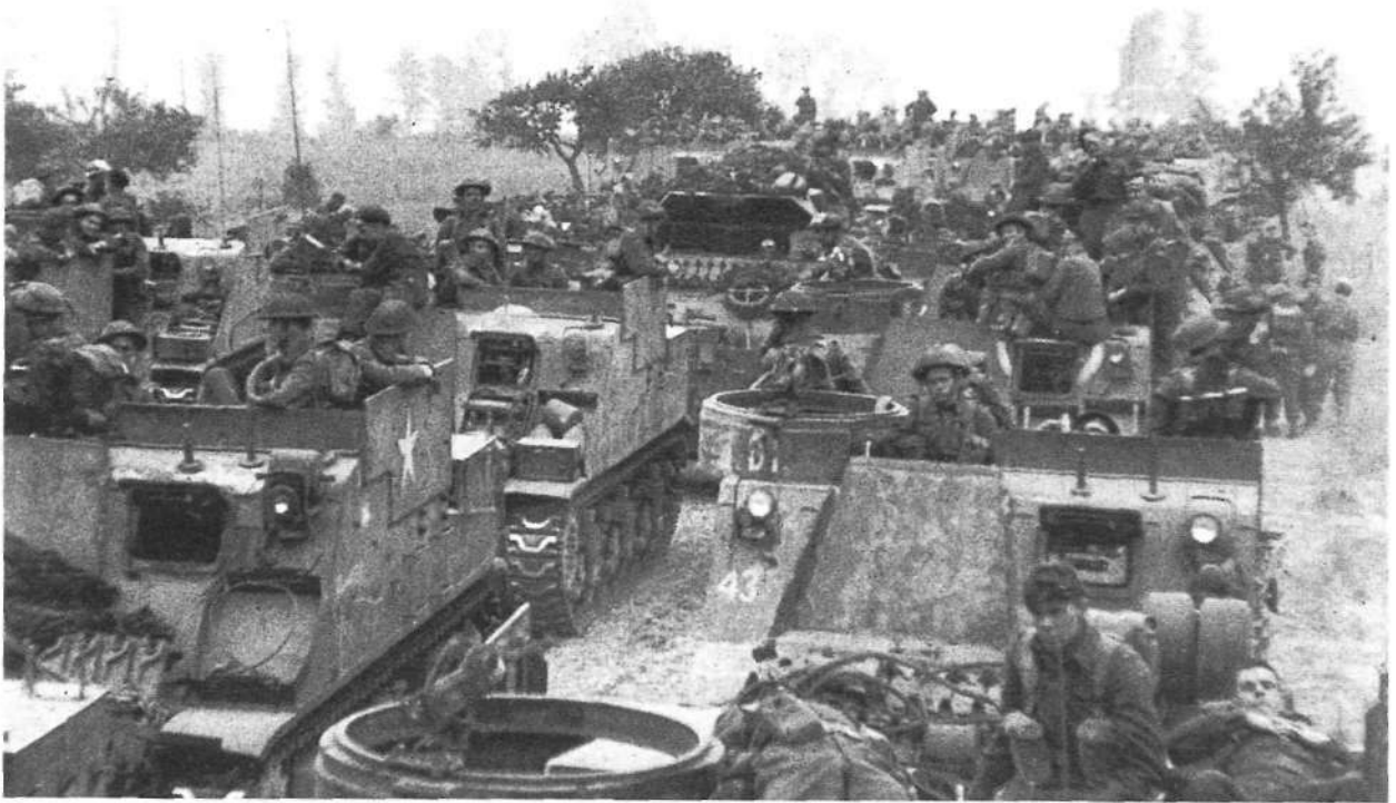
A column of "defrocked Priests" carrying troops of the 4th Canadian Infantry Brigade line up in preparation for Operation "Totalize," 7 August 1944.

"AWD Kangaroo" established itself in two fields near Bayeux on 2 August. By that evening 14 vehicles had been stripped. Armour plate was obtained from a "help-yourself" park of "W" Crocks (tanks beyond repair); mild plate was found south of Caen and also cut from landing craft stranded on the Normandy beaches. Although a work schedule had been made, most of the maintainers found themselves working around the clock. By 2000 hours on 5 August, 72 carriers had been completed and six more were ready by noon on the 6th, 5 although Stacey states that a total of 76 were ready by the 6th. 6