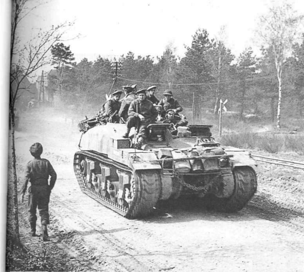
Ram Kangaroos in Action.

Left: Soldiers of the Argyll and Sutherland Highlanders being rushed forward in convoys of Kangaroos, 11 April 1945.