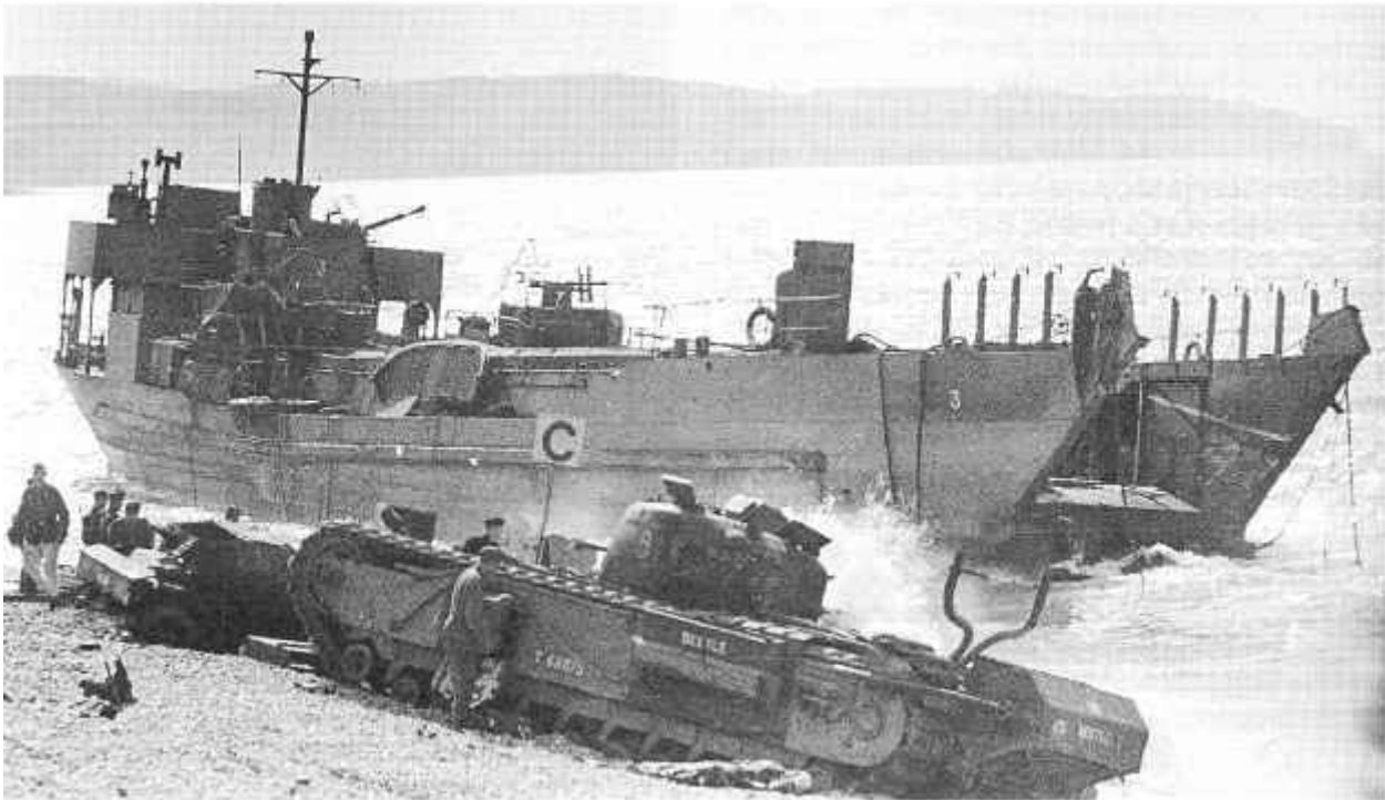
BEEBLE was the last of three Churchill Mark II Oke flamethrower tanks of 8 Troop, "B" Squadron to exit TLC-3, seen stranded in the background. Immediately after landing its right track broke while turning on the rocks forcing it to act as a stationary pillbox until the surrender. Note the armoured flamethrower fuel box at the back and the Ronson nozzle pointing up at the front. None of the flamethrowers were used during the raid.

where one was immobilised by the chert. 21 The remaining 12 tanks never got off the beach; four had their tracks broken by shellfire, four by the chert and three most likely by the chert, although this is not certain. The last tank chose to stay on the beach and was mobile for the duration of the battle. 22 The tanks on the promenade drove back and forth, unable to penetrate the town because of the huge concrete road blocks, on which the tanks' puny armour-piercing shells had no effect.