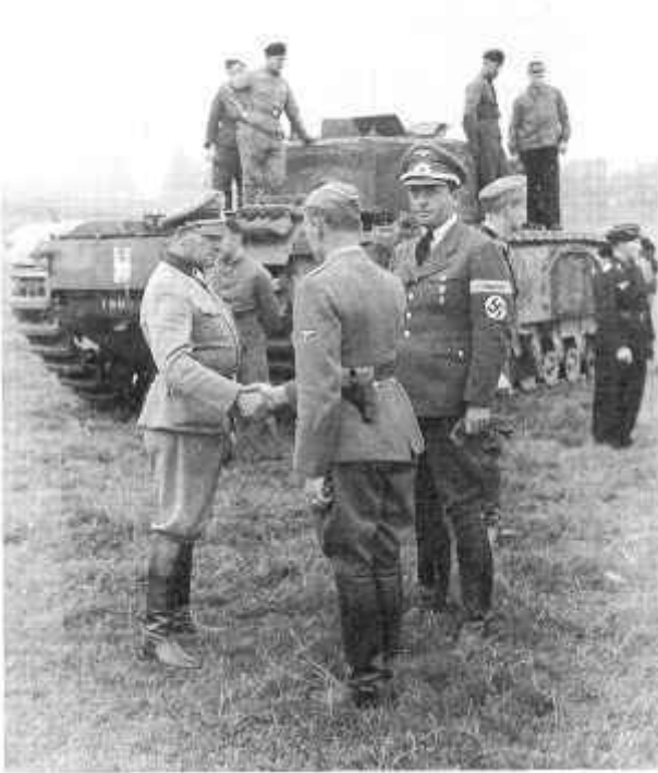
Many high-ranking German officials and officers came to inspect the aftermath of the raid. Near Dieppe, Sepp Dietrich (left) and Albert Speer (right, facing camera) examine captured Churchills and observe firing tests. In the background is CAT, which was disabled on the promenade by a hit from a JU-87 Stuka dive bomber.

probably because the charges had been damaged by enemy fire. A few crews even had to manually cut this away, either because the partially blown fabric had jammed their turret traverse or obscured their vision ports. Proper testing of this equipment under actual fire, especially during disembarking training, would have revealed its vulnerability. No arrangement was made for shedding the exhaust extensions. 31