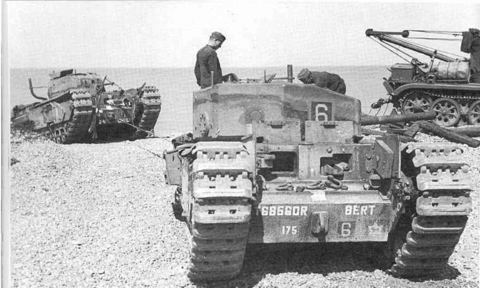
BERT was immobilized on the promenade when shell fire broke its left track. After the battle it was repaired by German engineers and is seen here towing CHIEF off the beach.

on the beach from a mortar practice carried out the previous day. Their fire plan was well laid out and beautifully coordinated." 13