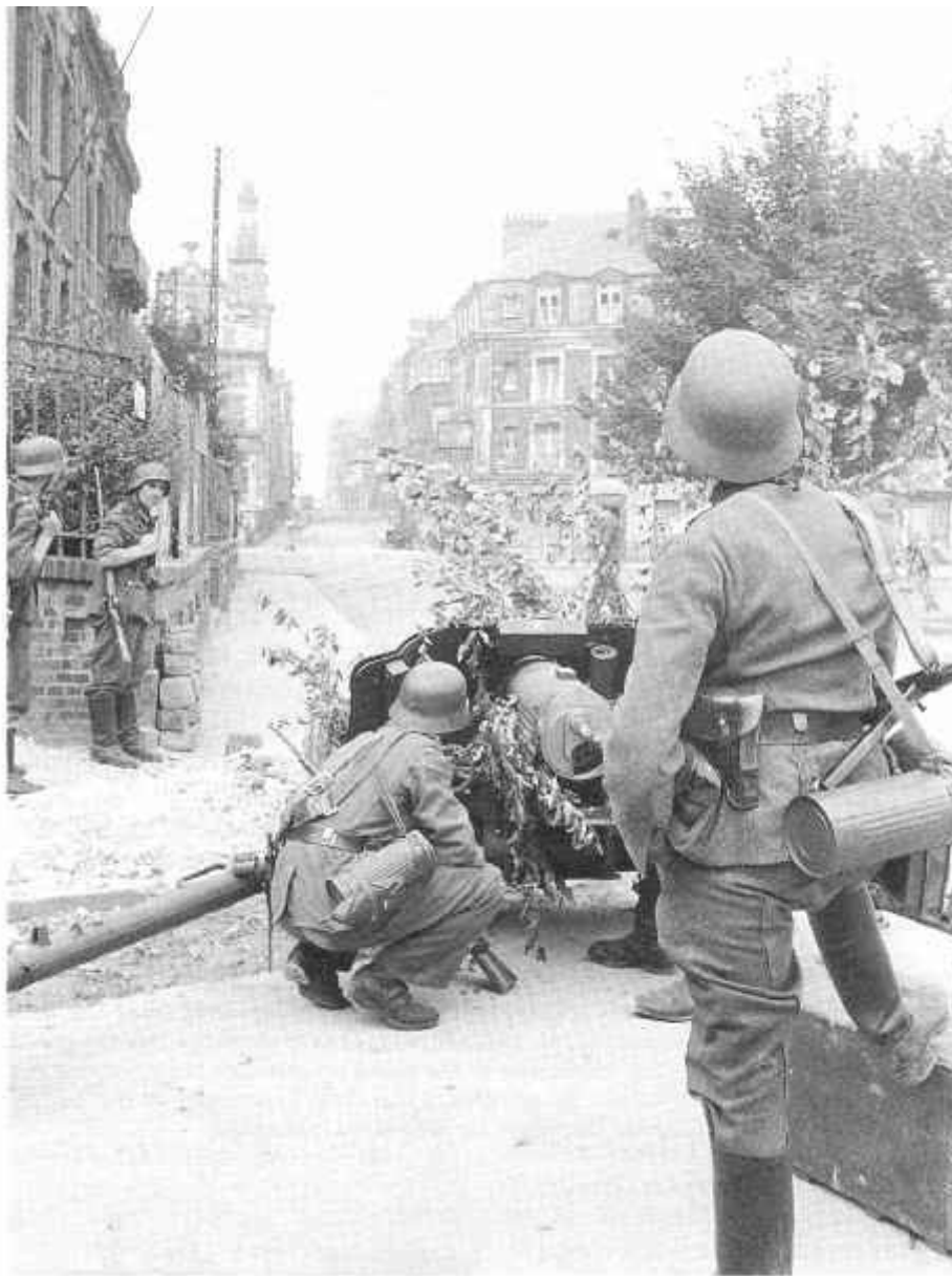
During the battle an accurately sited German anti-tank gun and crew lie in wait near the end of the Rue de Sygogne for the possible penetration of any tanks.

On the flanks, Commandos would capture and destroy the coastal batteries about five miles east and west of Dieppe, while infantry were to neutralise coastal batteries on the east and west headlands which dominated the town. 9 The Cameron Highlanders of Canada were to advance to meet the tanks of "A" and "B" Squadrons, 14 CATR, behind the town and then advance against another coastal battery, an emergency fighter airfield, and the local enemy divisional headquarters thought to be at Arques-la-Bataille. These flank attacks were an essential requirement for the success of the main frontal assault, half