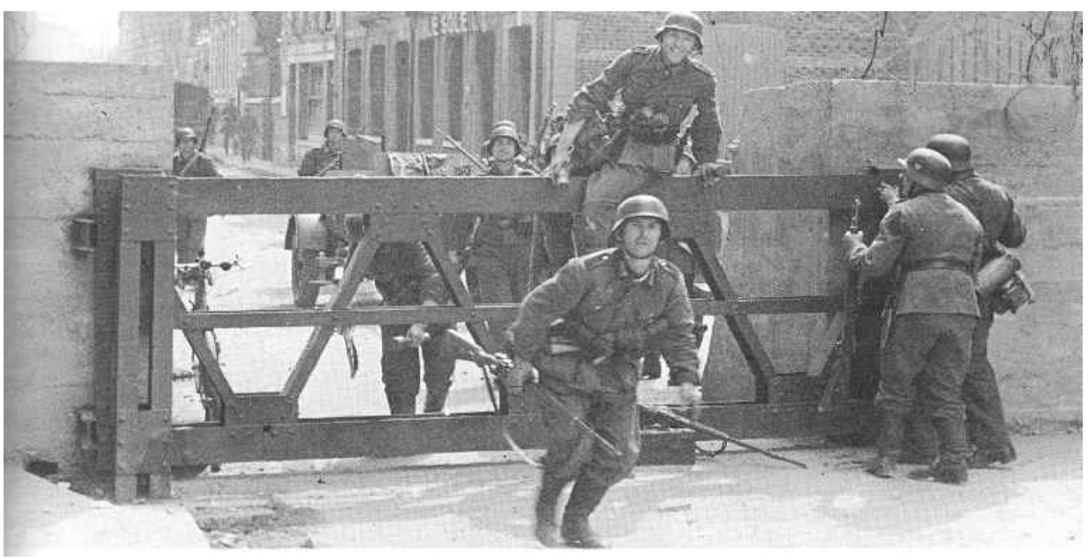
Late in the battle, on 19 August, German reinforcements climb over the metal gate blocking the Rue de Sygogne. This metal gate would not have presented a problem to a 40-ton Churchill tank. Note the 7" high and 4-5" wide reinforced concrete anti-tank wall. These extended across all the streets to the promenade with only a small gap to allow personnel to pass. They were surmounted by barbed wire and had a firing step behind for snipers.