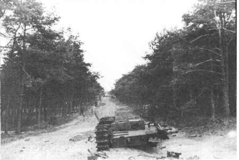
This series of photos illustrates the vulnerability of the Canadian armour during their thrust to Wouvsche Plantage. At the top are Shermans of the South Alberta Regiment. Above and to the left are shots of a Churchill tank "brewed up" by a mine on the road.

Von Rundstedt decided to withdraw his 15th Army "to the general line Bergen-op-Zoom-Roosendaal-Breda-Dongen-west of S'Hertegenbosch."