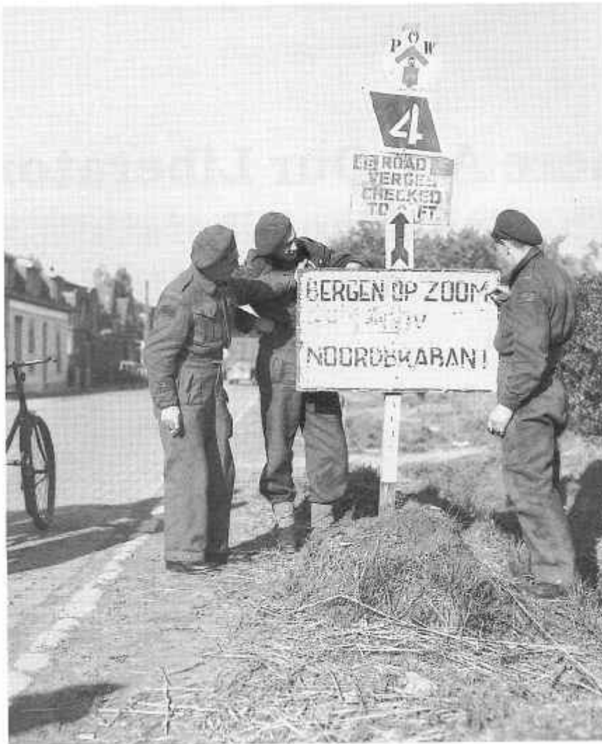
Canadian soldiers stand on the outskirts of "BERGEN OP ZOOM. "

Markt" is surrounded by a variety of shops, cafes, residences and the "Pepebus," the name given to the medieval clock tower that marks the entrance to the Catholic church.