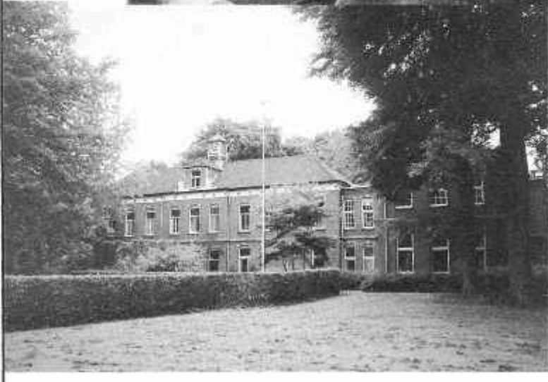
Below: The Main Pavilion, Het Groot Graffel, photographed in 1994. The little clock tower where the letter from the German soldier was found can be seen on top of the building.

"Stop firing at my hospital, stop firing at my hospital," he shouted.