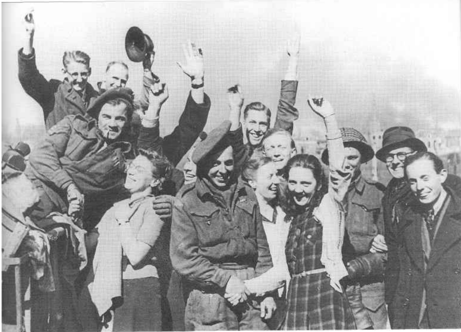
Men from "B" Company of the Glens celebrate with Dutch citizens shortly after their liberation on 7 April