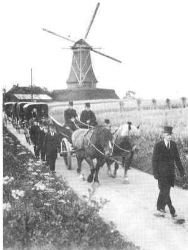
A funeral procession passes by the windmill in Leesten centre in 1940. It is along this same stretch of road that "B" Company of the Glens was trapped on the afternoon of April 4, 1945.

I'm pretty sure it was in Leesten that we were called upon to help with a platoon that got into trouble. They were pinned down along a road which had a raised bank on one side. Perhaps about 12 feet high. I saw one man clamber up that bank to look over the edge. He tumbled down again with a bullet in his head. We then made smoke and the platoon retreated behind that smoke screen.