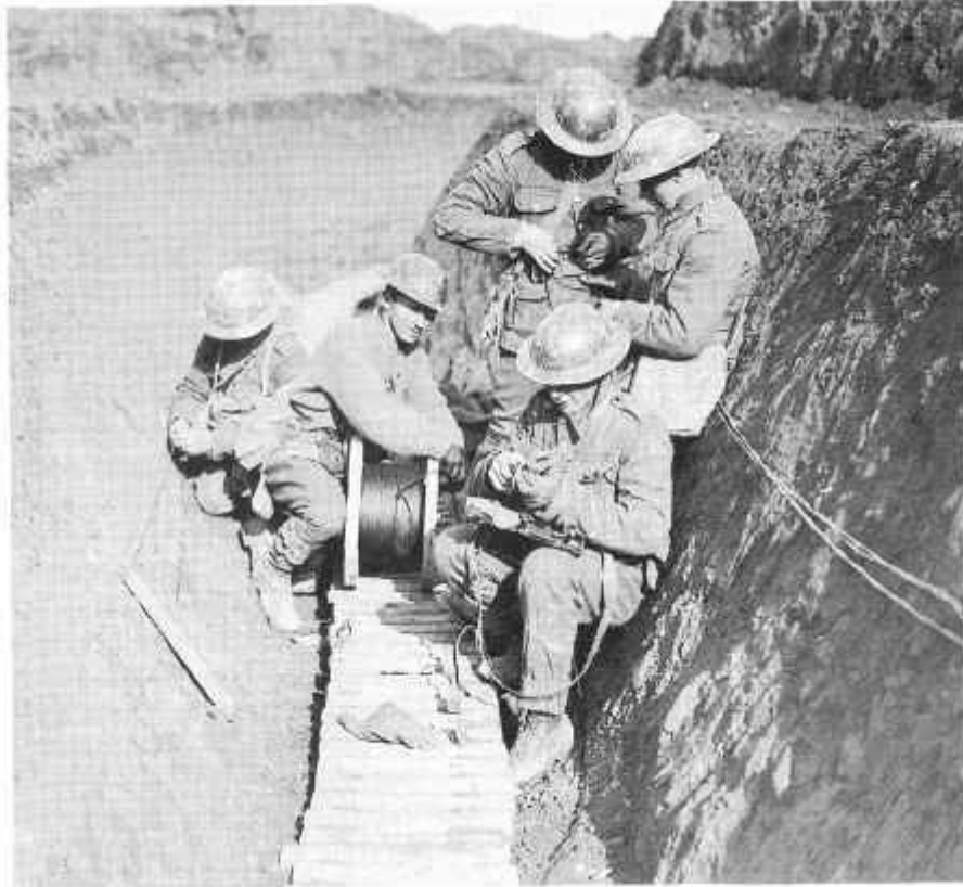
Repairing wire in a communication trench, February 1918.