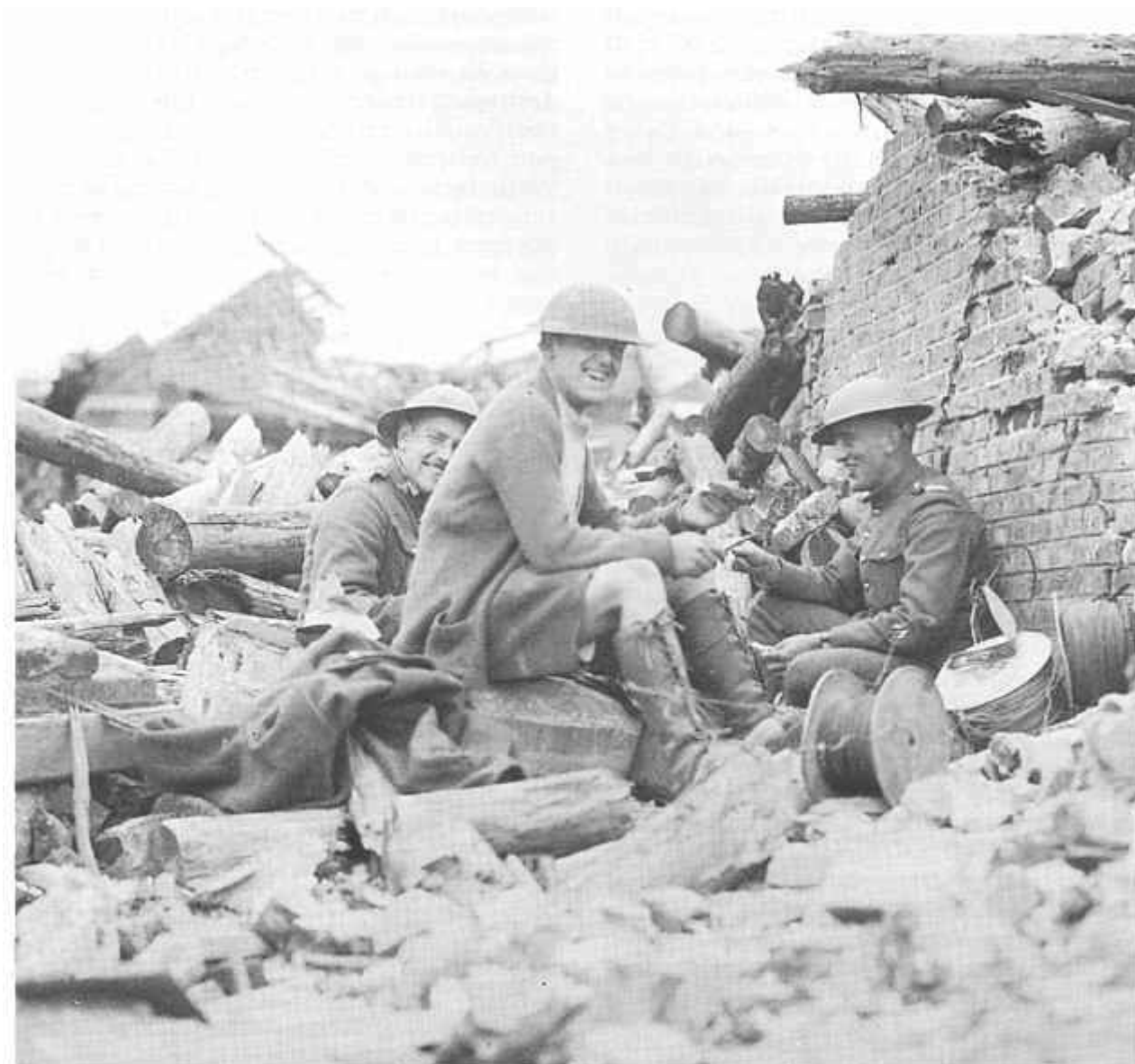
During a brief rest, Canadian Signallers enjoy a light moment resting beside an old German bunker near Lens, September 1918.