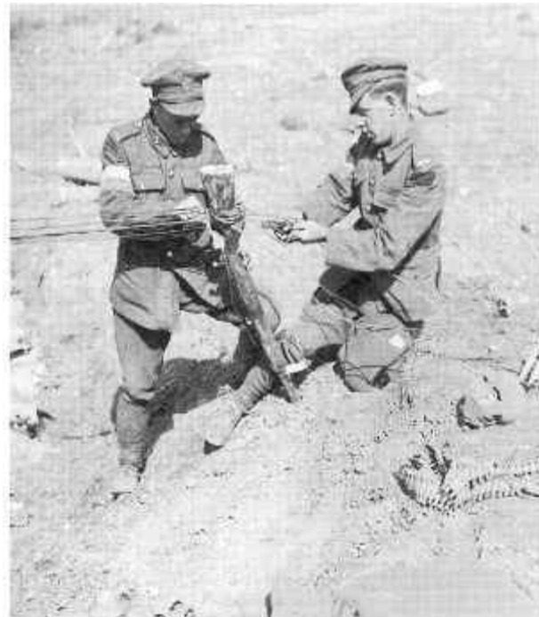
To keep wires off the ground Canadian Signallers use a German rifle as a telephone pole. September 1918. NACPA3100

office had a direct wireless link to the air reconnaissance unit so it could fire on German guns as soon as they were located. 42 While destroying trenches, gunners tried to get one observation aircraft for every one of their six-gun batteries. 43 All-in-all the Royal Flying Corps faced a wide variety of demands as a communications link between gunners and the front line at a time when air operations had become so hazardous the period was later called "Bloody April."