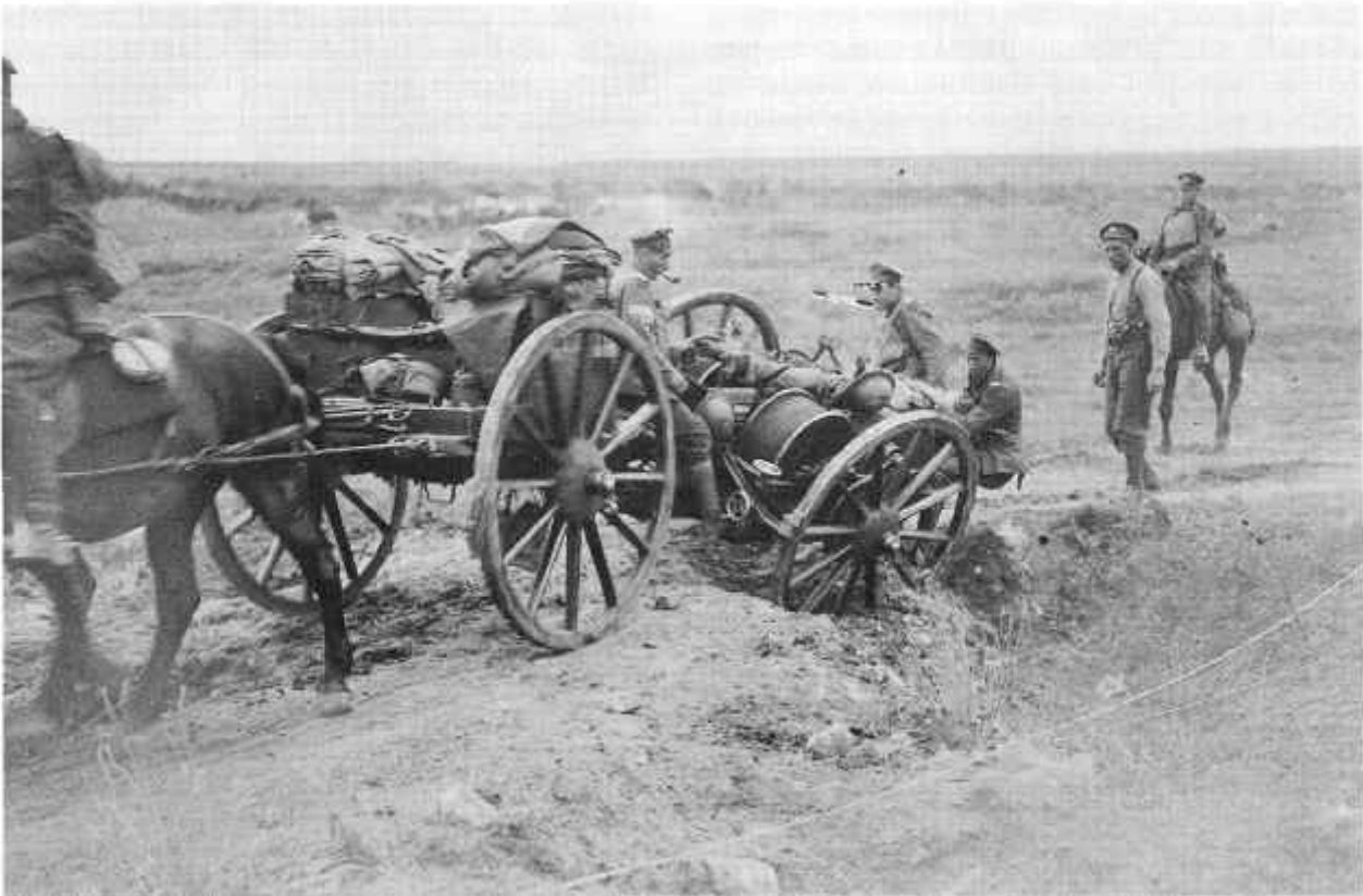
Canadian Signal Section laying cable during the advance east of Arras, September 1918.