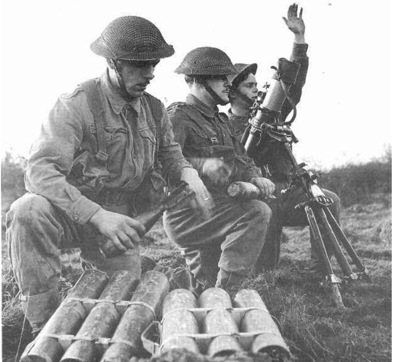
A crew from Les Fusiliers Mont-Royal training with the 3-inch mortar, February 1943.

This naturally led to studies of the use of radar in coastal artillery fire which had proven much less accurate than the gunners had supposed. Schonland urged the Royal Artillery to investigate the employment of radar as a way of improving the accuracy of field and medium artillery, but senior officers at Larkhill, the artillery school, were not impressed with the experimental evidence of radar echoes from ground bursts or with suggestions that their methods of employing predicted fire were subject to serious error. Information that mortar bombs could be seen in the early part of their trajectories by the new (1943) GL Mark IIIB radars was also ignored prior to the invasion of Northwest Europe, 3 presumably because existing counter-battery methods had proved adequate for dealing with mortars in North Africa.