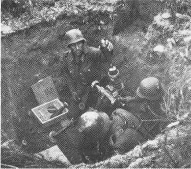
A German 80 mm mortar crew in action. This weapon could throw a 3.5 kg high explosive or smoke shell to a minimum distance of 60 metres or a maximum of 2400 metres at a rate of 15-25 shells per minute. The difficulty of spotting a well-emplaced mortar crew is evident from these photos.

mortar staffs, the goal of 60 to 80 locations a day could be reached on static fronts. 10 Swann cautioned that even with such changes, existing radar and four-pen recorders were useful only on static fronts and could not assist where improved counter-mortar methods were most needed, in advance and consolidation.